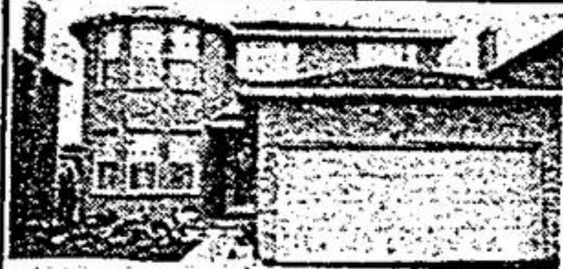
MOVE RIGHT IN! JUST LISTED

Beautiful home in north west Markham. Center hall plan with huge kit., walkout bsmnt. and spacious ensuite. Complete with 5 appliances & window coverings. John/Linda Hawco 294-1372.