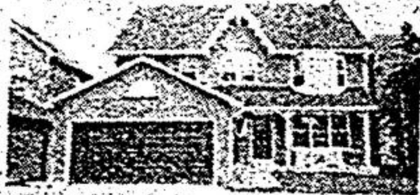
EXECUTIVE BRIDLE TRAIL HOME - OPEN HOUSE SUN. 2-4

Stroll around Toogood Pond, dine in quaint restaurants. Within walking distance from this 3600 sq. ft. Main St. home. 3 floors of luxury. Janice Jackson 477-1270.