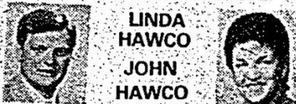
LINDA HAWCO JOHN HAWCO

4 or 5 Bdrm Monarch Home professionally decorated with spiral oak staircase to lower level, sunken living rm. and separate dining rm. 3 walkouts $267,000 John/Linda Hawco 294-1372.