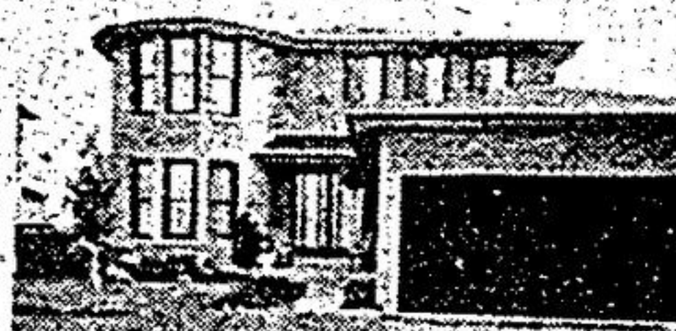
OPEN HOUSE SUNDAY JULY 27 — 2-4