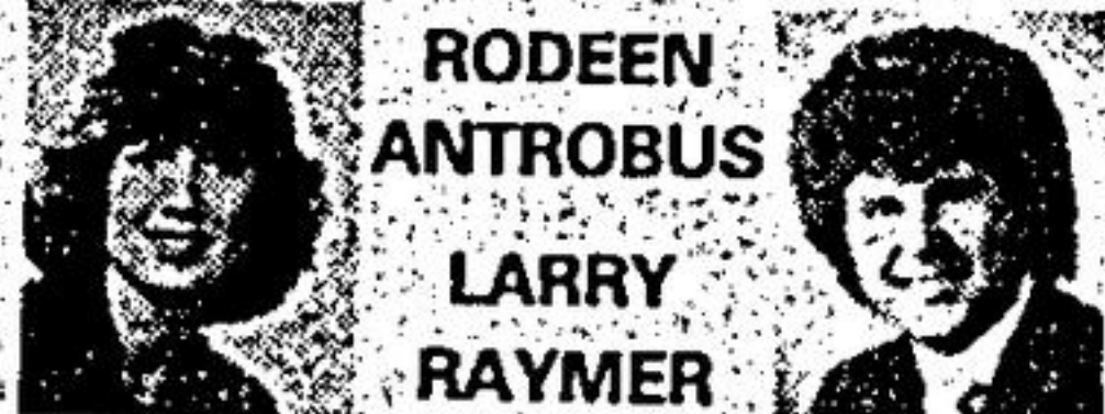
RODEEN ANTROBUS LARRY RAYMER

All brick, 3 baths — crescent lots — oak circular staircase. Larry Raymer — Rodeen Antrobus 294-1372.