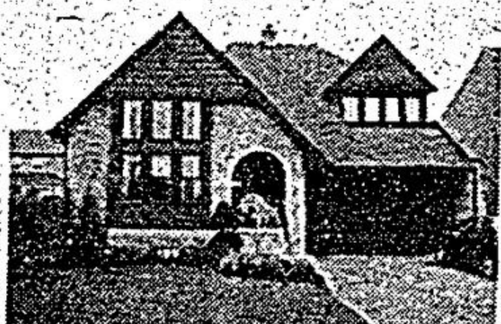
49 FERNDLE BRIDLETRAIL