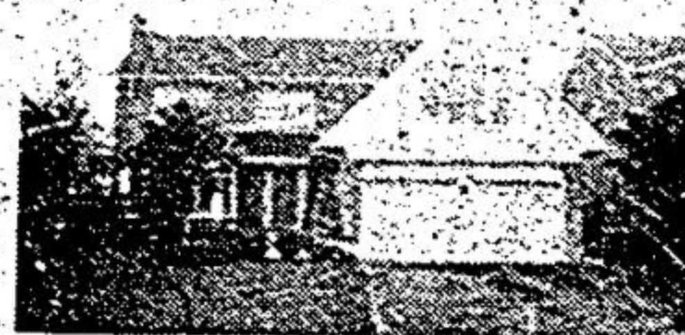
OPEN HOUSE SUN. JULY 27TH 2-4 P.M. 44 FERNDLE