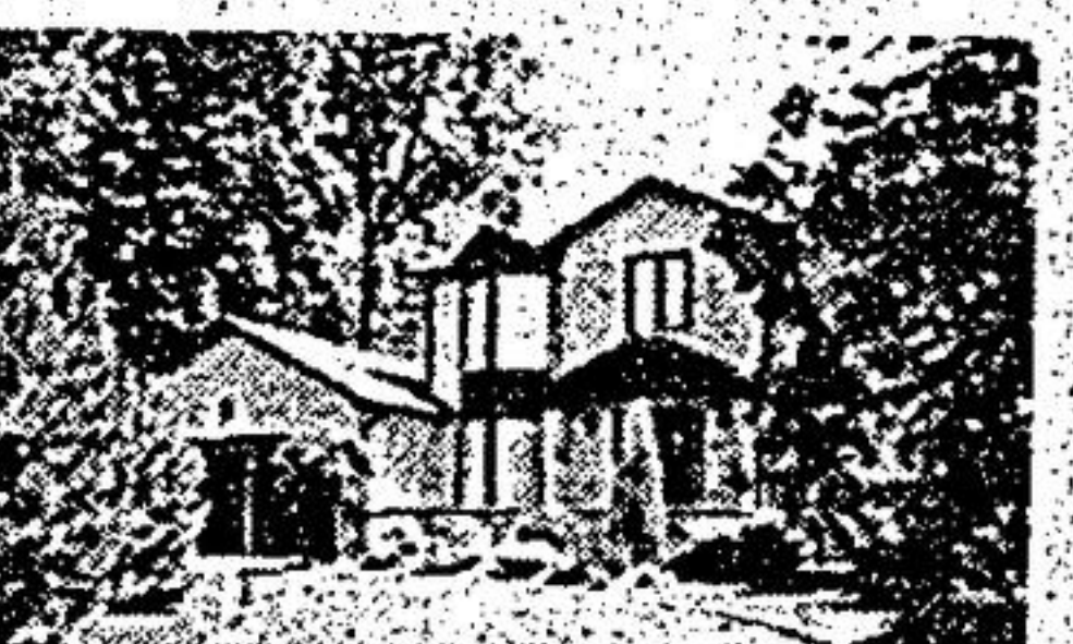
MAIN ST. UNIONVILLE