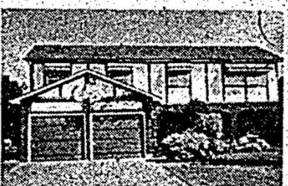
156 RAMONA BLVD