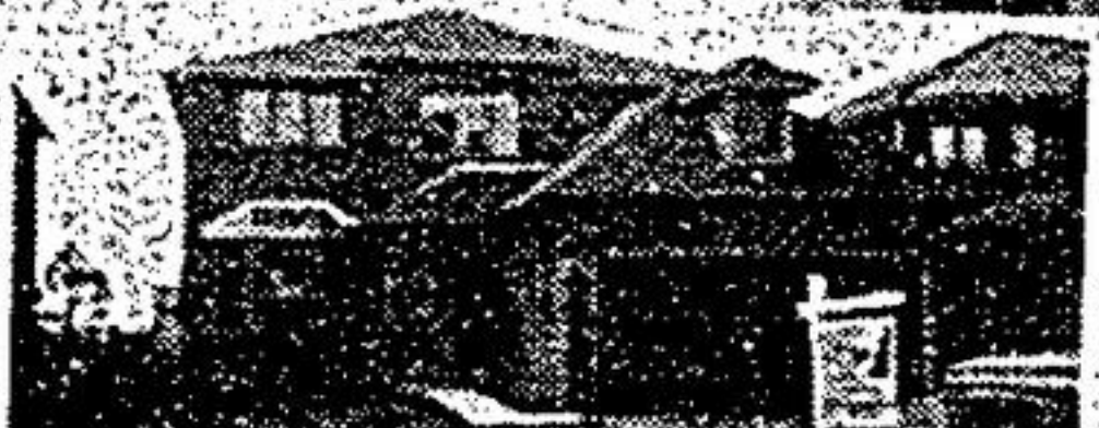
JUST LISTED COURT LOCATION

4 Bedroom dream kitchen — jacuzzi — skylight — ceramics throughout — sunken living room — choose your broadloom. Rodeen Antrobus 294-1372.