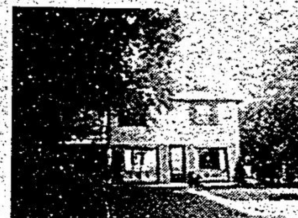
WHY PAY RENT?