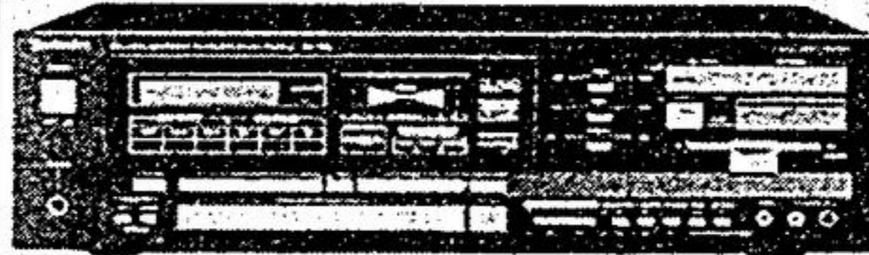
SA-956 Computer Drive TV/FM/AM Receiver