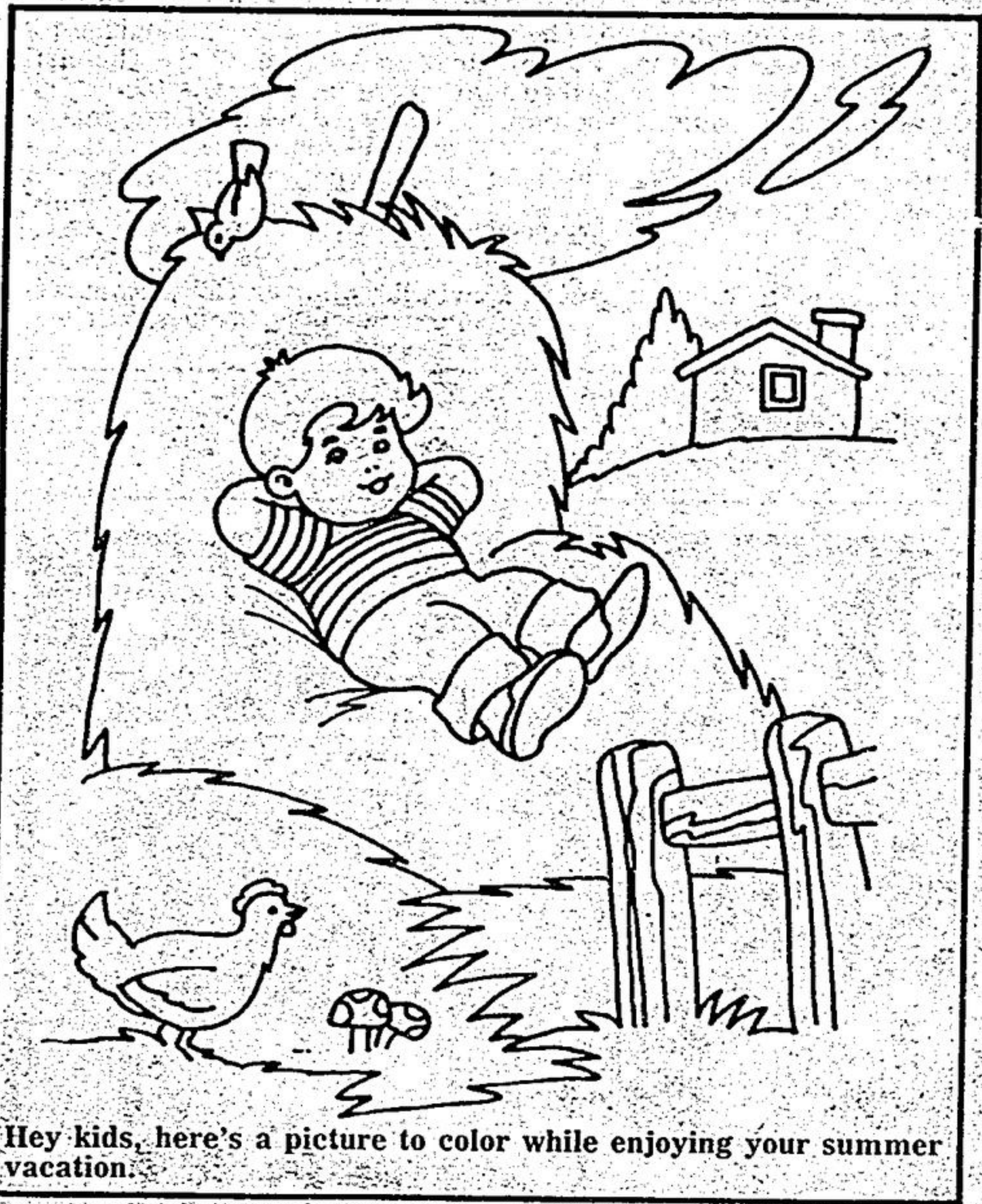
Hey kids, here's a picture to color while enjoying your summer vacation.