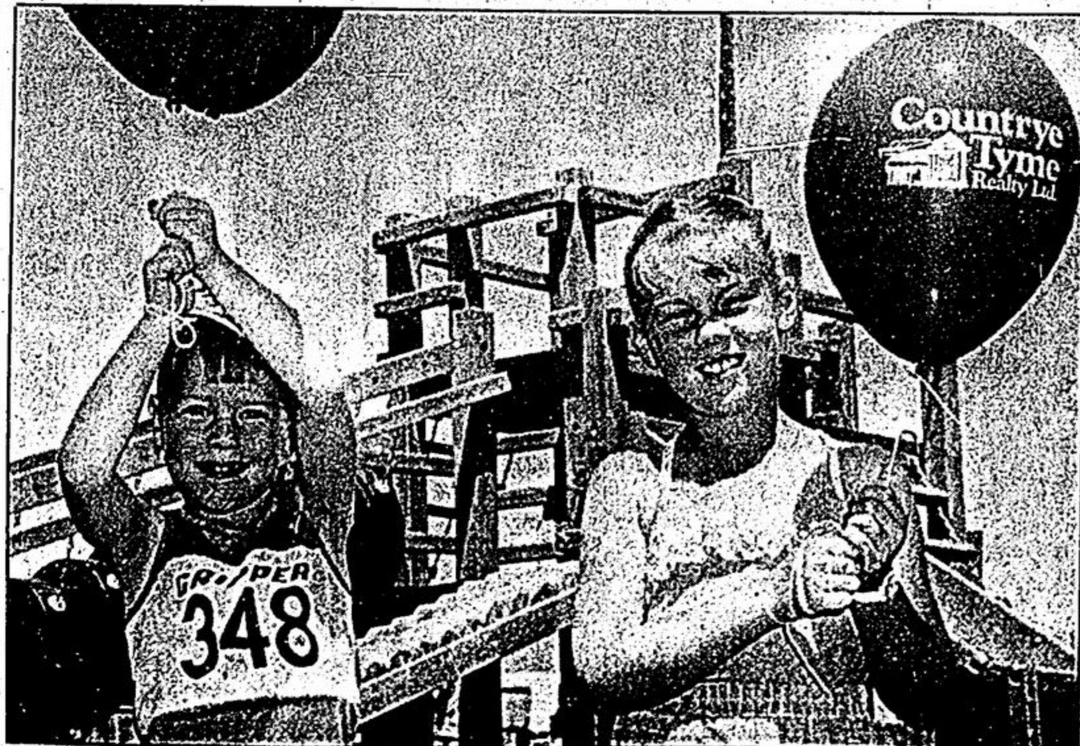
Balloons will always be popular with kids. Owners of Country Tyme Realty Ltd., Main Street East, Stouffville, are aware of this. Proof