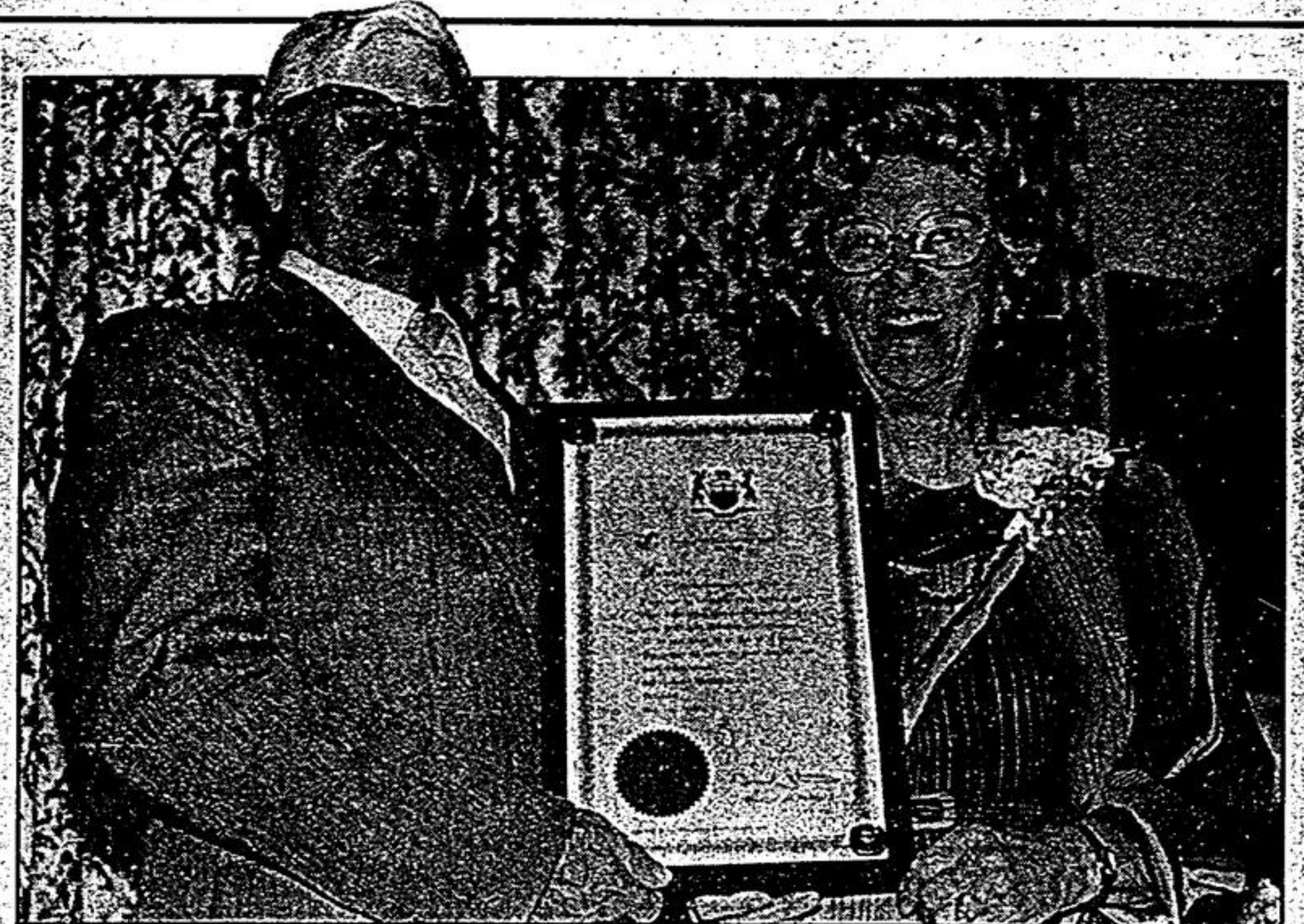
Former Whitevale couple celebrates 50th anniversary

Blessed are they who ease the days of my journey Home in such loving ways.