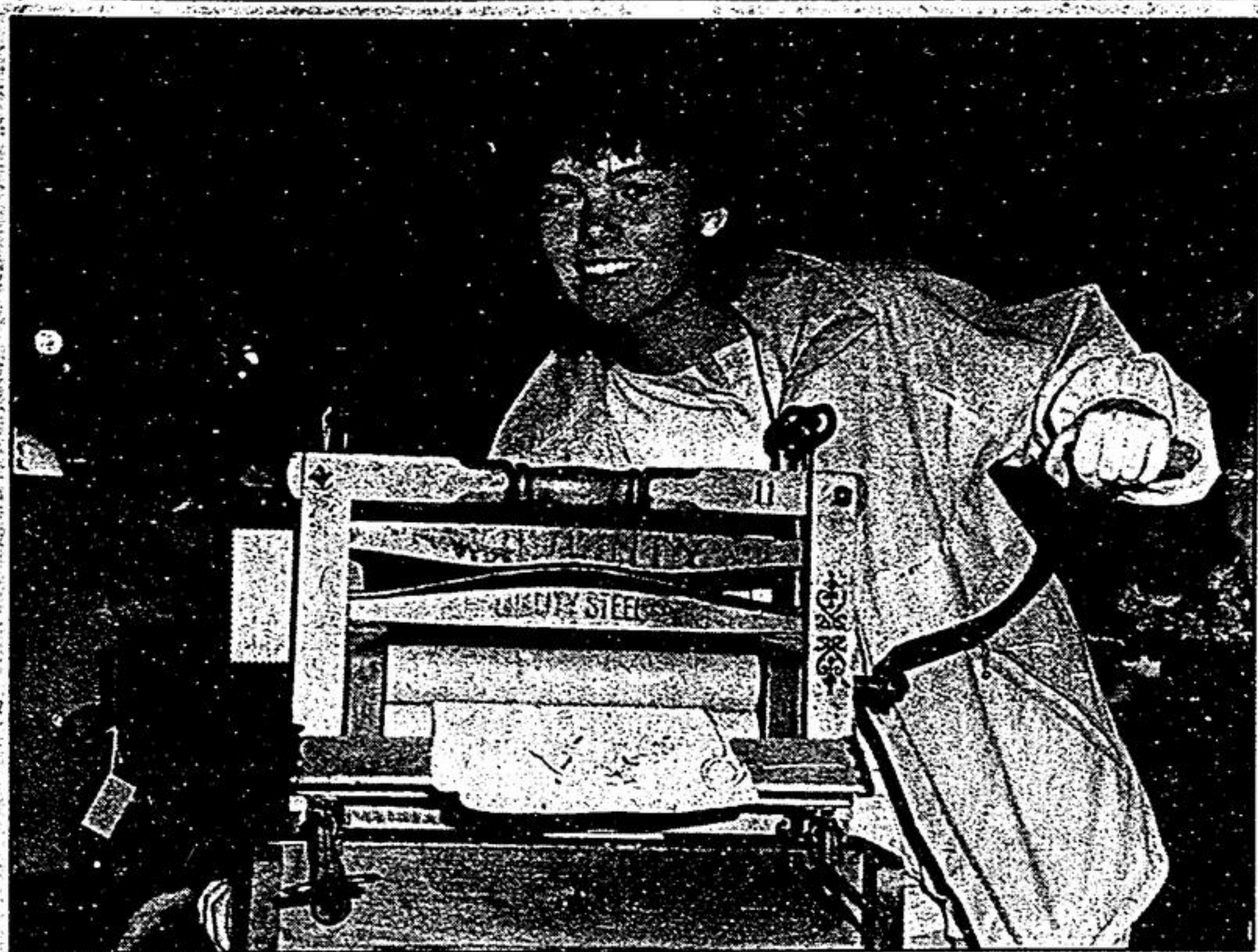
A mix of young and old