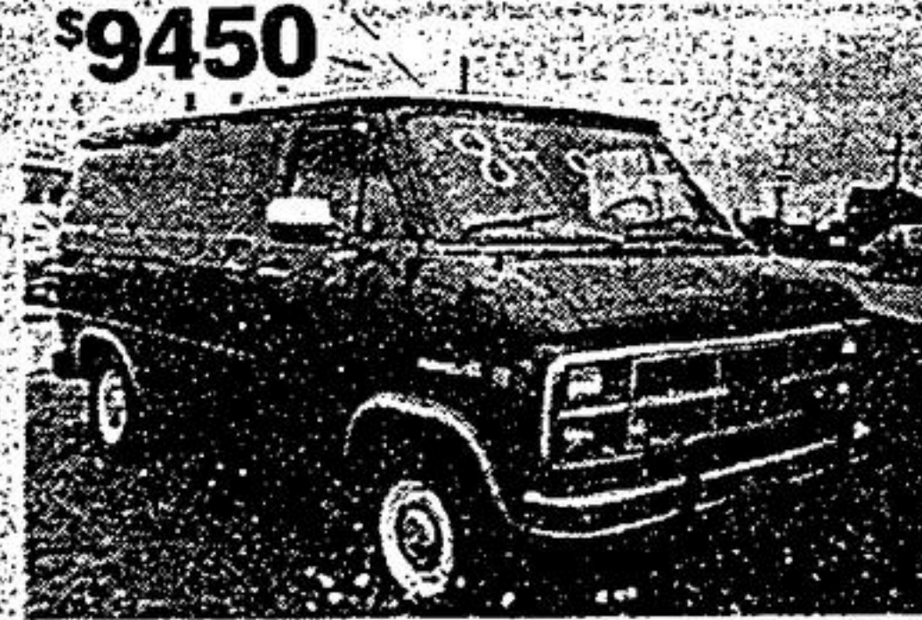
$9450 1984 GMC SHORT WHEEL BASE VANDURA Fully insulated, sun roof, loads of options. Extra clean.