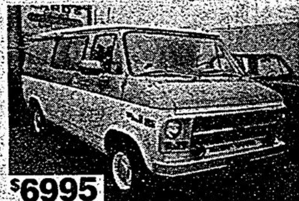
$6995 1982 GMC 1/2 TON VAN 125" wheelbase, 8 cyl., p/s, p/b, 2 tone paint, buck seats.