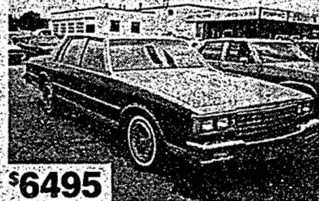
$6495 1981 CHEV CAPRICE CLASSIC 4 dr. sedan loaded with all the extras.