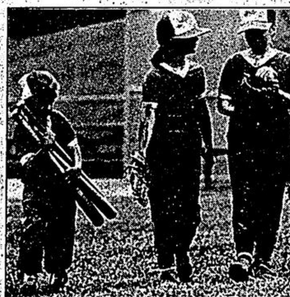
THE GOOD NEWS! Home team won, but what a mess.