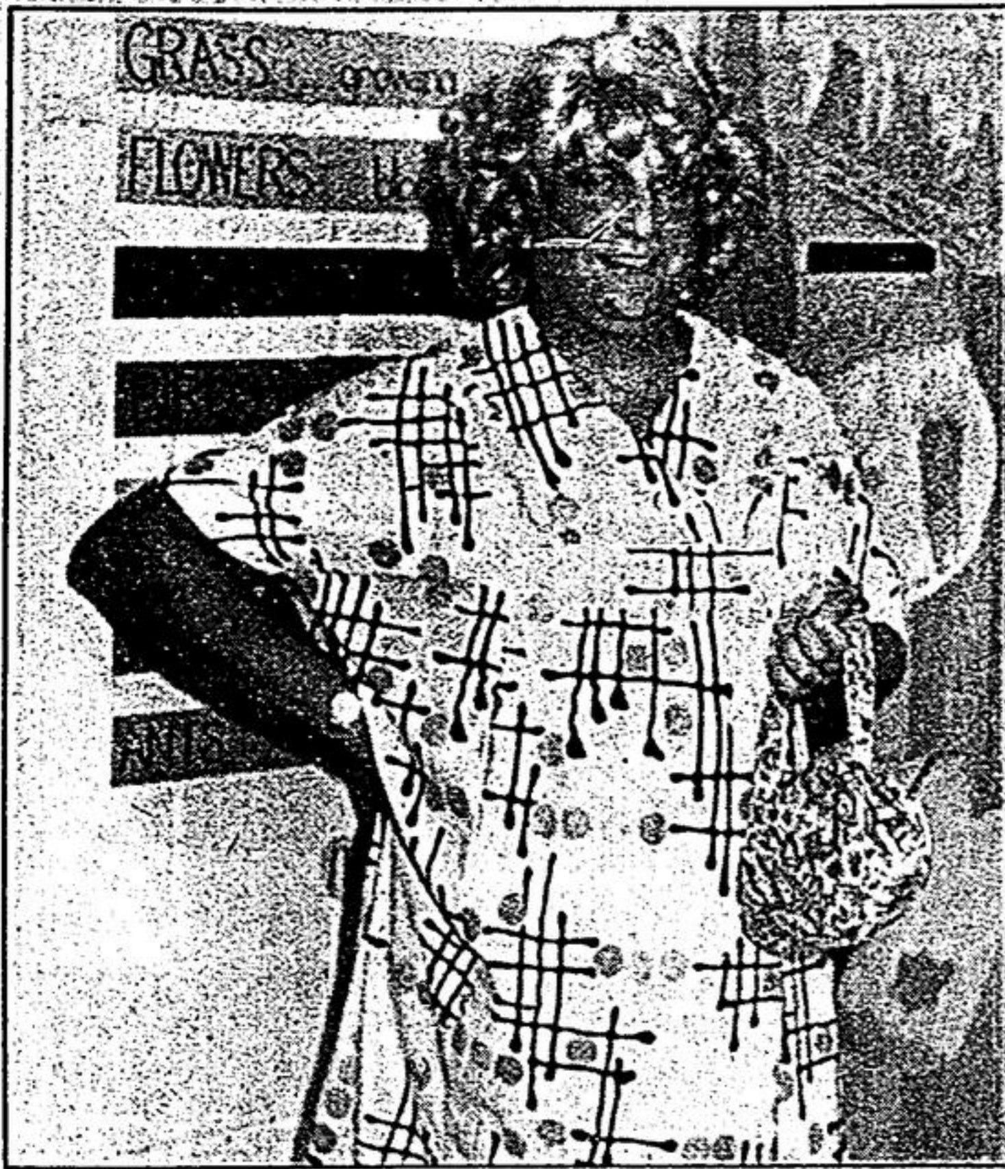
All dressed up and...