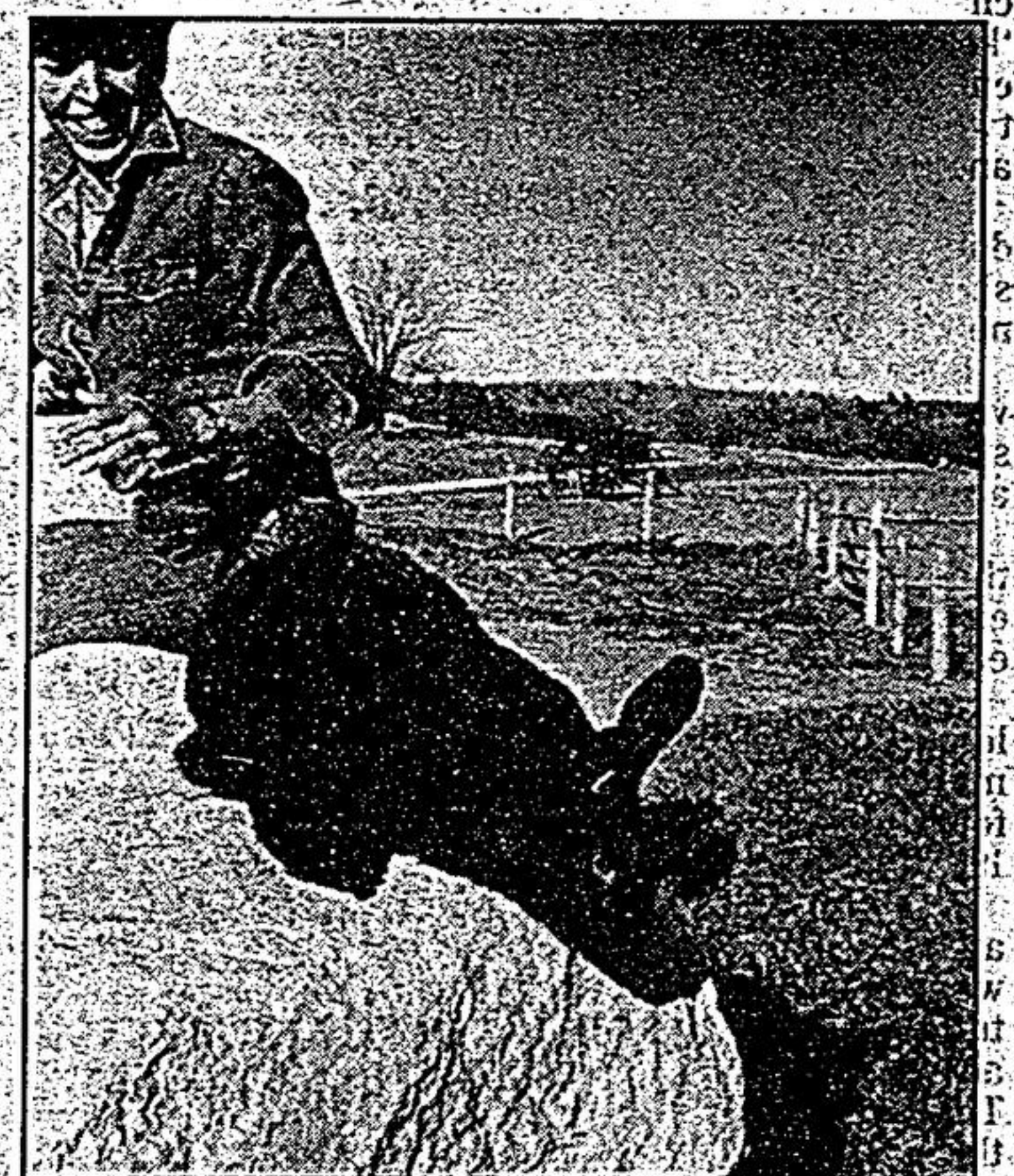
into the spotlight at Pleasure Valley's petting farm.