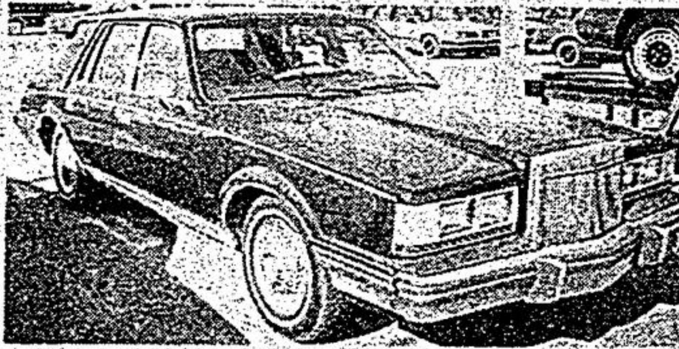
1982 LINCOLN CONTINENTAL Loaded with all the fine Lincoln options. Black & Burgundy.

MON-THURS. 9 A.M.-9 P.M.; FRI. 9 A.M.-6 P.M.; SAT. 9 A.M.-5 P.M.