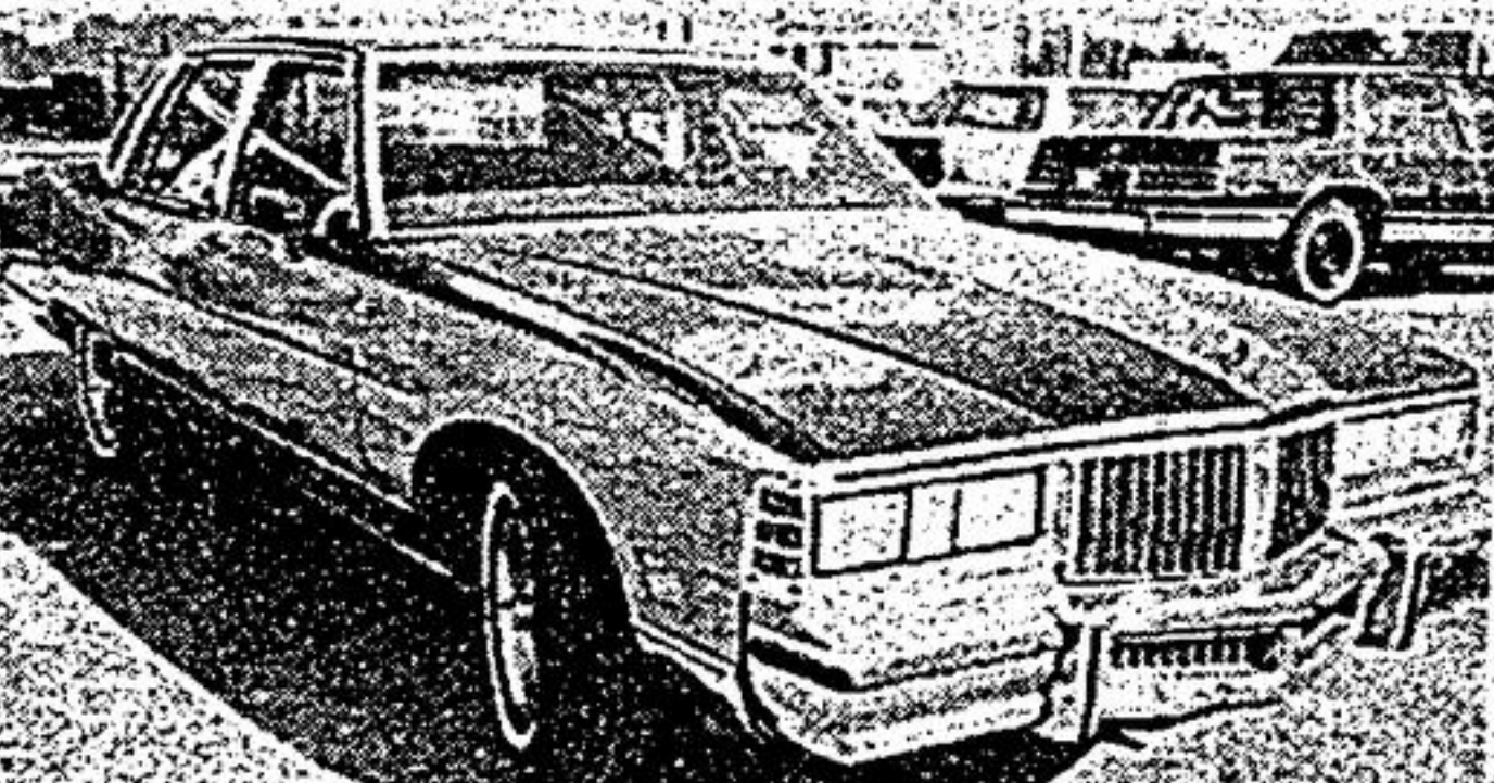
1981 Parisienne Brougham, 4 dr. sedan. Power windows, door locks, am fm stereo, air conditioning, p s p b automatic transmission, luxury interior, 2 tone blue.