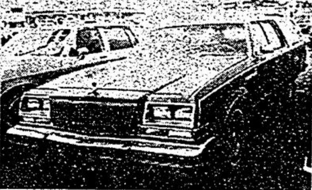
1979 BUICK ESTATE WAGON Fully loaded, certified, ex. condition. Dark blue with wood grain.