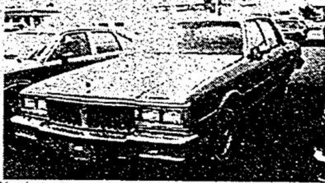
1982 PONTIAC PARISIENNE 4 door, air conditioning, 1 owner, exc. shape, powertrain warranty.