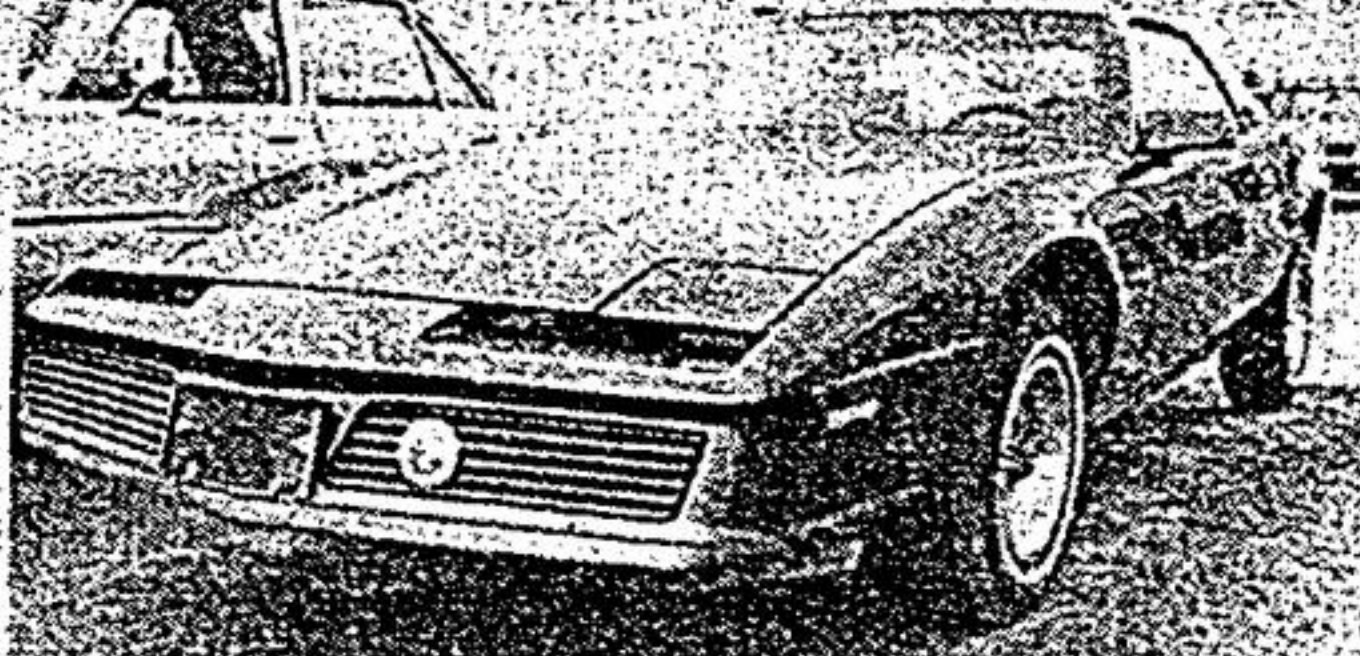
1984 PONTIAC FIREBIRD Dark brown & beige, cloth interior. P/B, P/S, AM/FM radio. Not too costly to run. Certified.