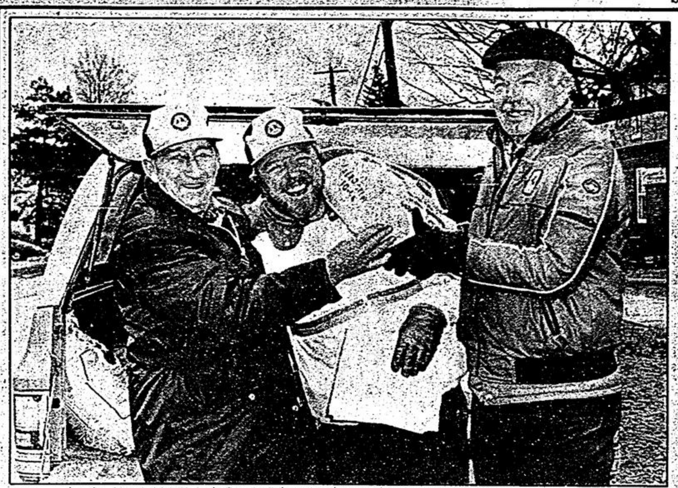
The Lion's share of the load