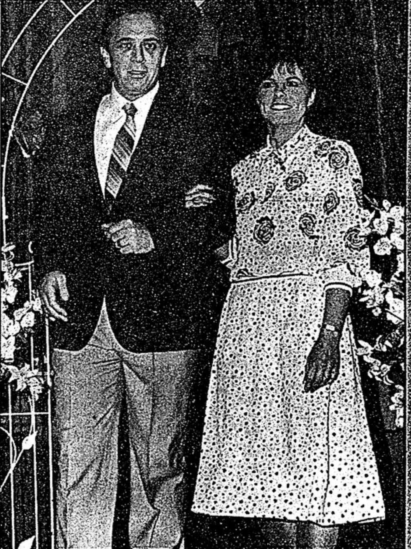
Fashions for boys or gentlemen as well as ladies. Shown here are items for men and women. Among several valuable prizes were a pair of diamond earrings.