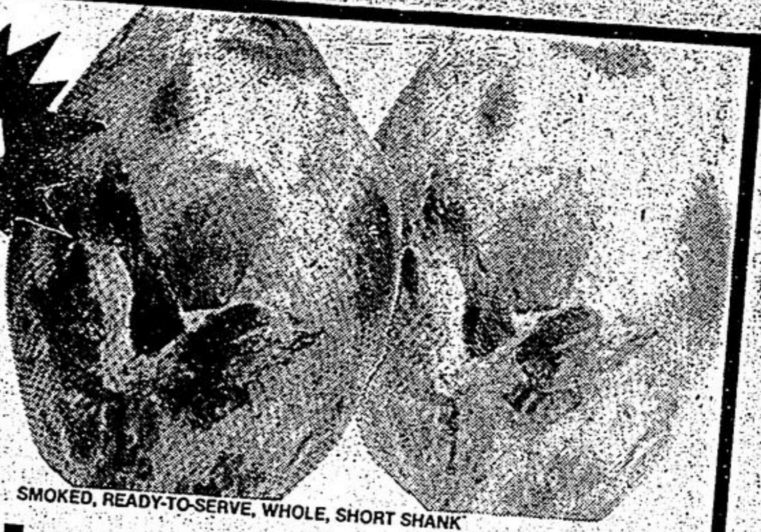
SMOKED, READY-TO-SERVE, WHOLE, SHORT SHANK