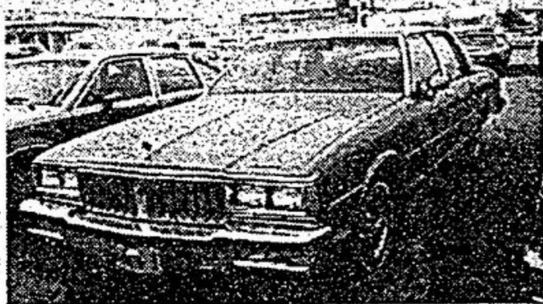
1982 PONTIAC PARISIENNE 4 door, air conditioning, 1 owner, exc. shape, powertrain warranty: 10,000 kms. or 6 months.