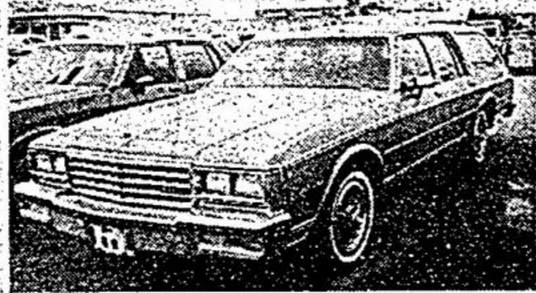
1983 CHEV CAPRICE STATION WAGON Loaded, low mileage, 1 owner, excellent condition.