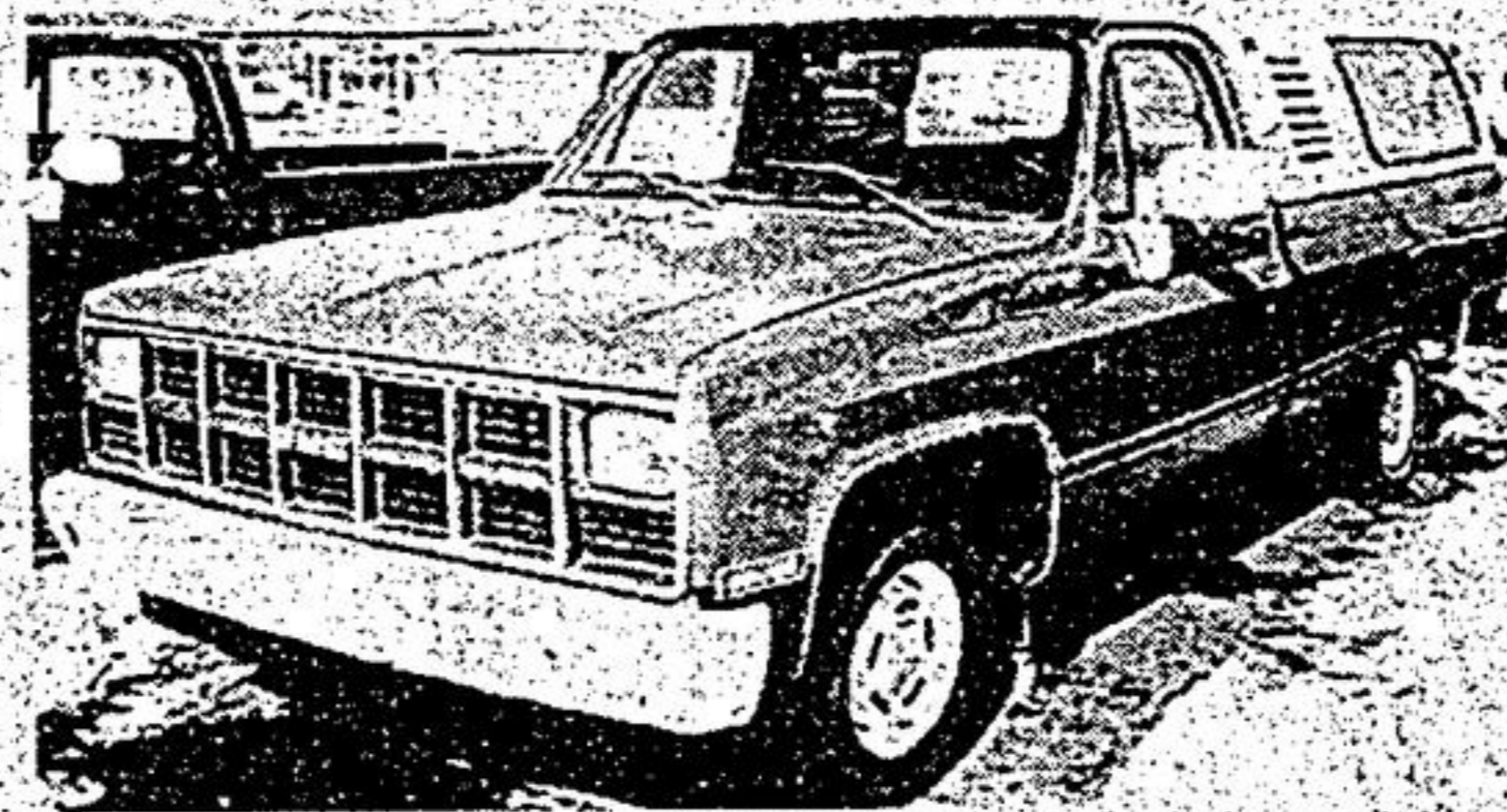
1981 GMC V8, automatic, P.S., P.B. Curtis Cap, 2 tone burgundy.