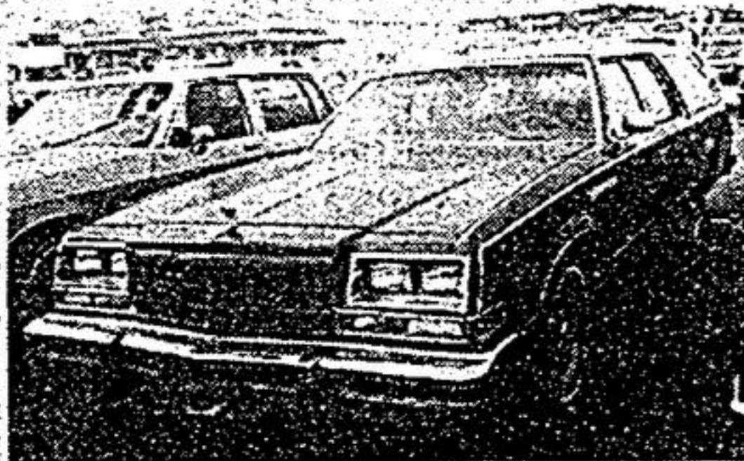
1979 BUICK ESTATE WAGON Fully loaded, certified, ex. cond., dark blue with wood grain.

477 MAIN ST. W., STOUFFVILLE MON.-THURS. 9 A.M.-9 P.M.; FRI. 9 A.M.-6 P.M.; SAT. 9 A.M.-5 P.M.