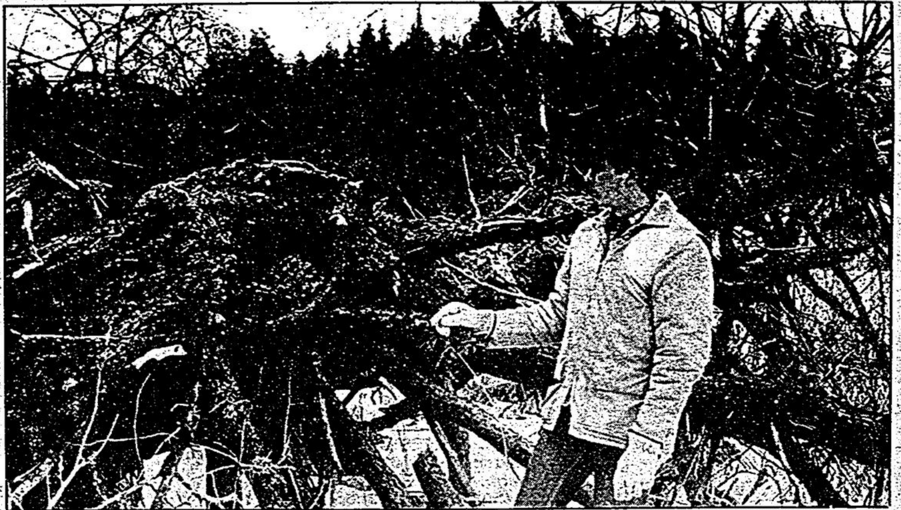
An old Hemlock tree located in an Uxbridge conservation area is a favorite subject for Brent Townsend, who has on several occasions portrayed its unique shape and texture with painstaking precision. — Chris Shanahan