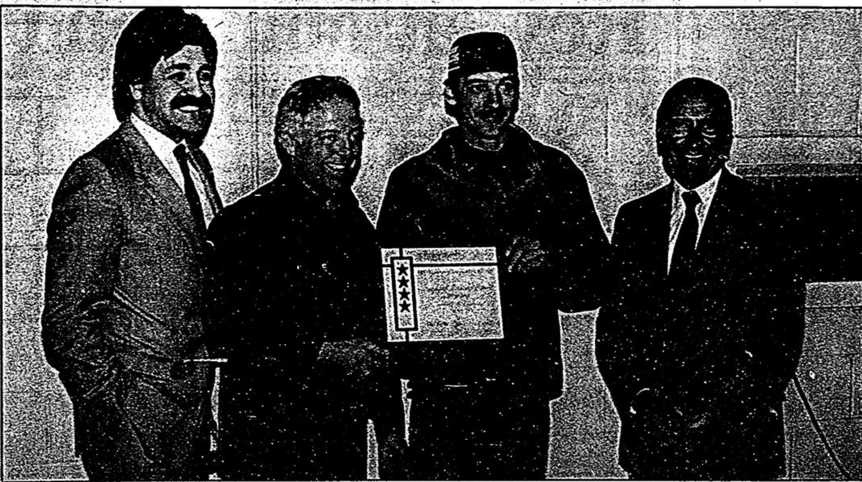
Stouffville pipe manufacturer receives fifth safety star

The next budget meeting is scheduled for April 2. A draft of the 1986 budget will be brought before the board's finance committee on April 21 and will go to the full board for approval on April 28.