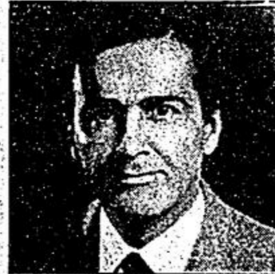
Minister of Consumer and Corporate Affairs The Honourable Michel Côté Guest Speaker

At The Aurora Highlands Golf Club on Monday, February 10, 1986 at 8:00 P.M.