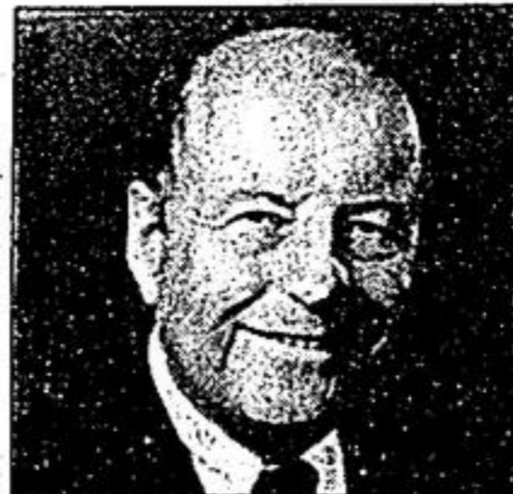
Minister of Regional Industrial Expansion The Honourable Sinclair M. Stevens Speaker