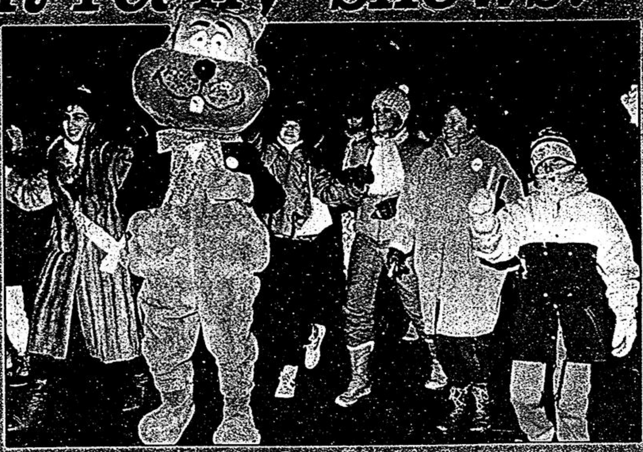
A new mascot helped add a little spark to Claremont's third annual winter carnival Jan. 29 to Feb. 2. Giant gopher Mr. C.W.C. was on hand to officiate at virtually every event, including a gala parade on Saturday.