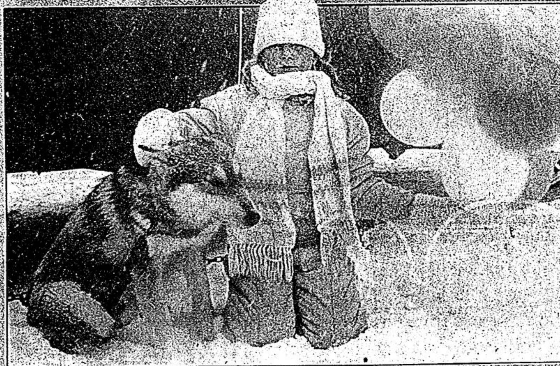
Carnival-goers all had their own methods of coping with the brutal snow storm on Saturday, after-