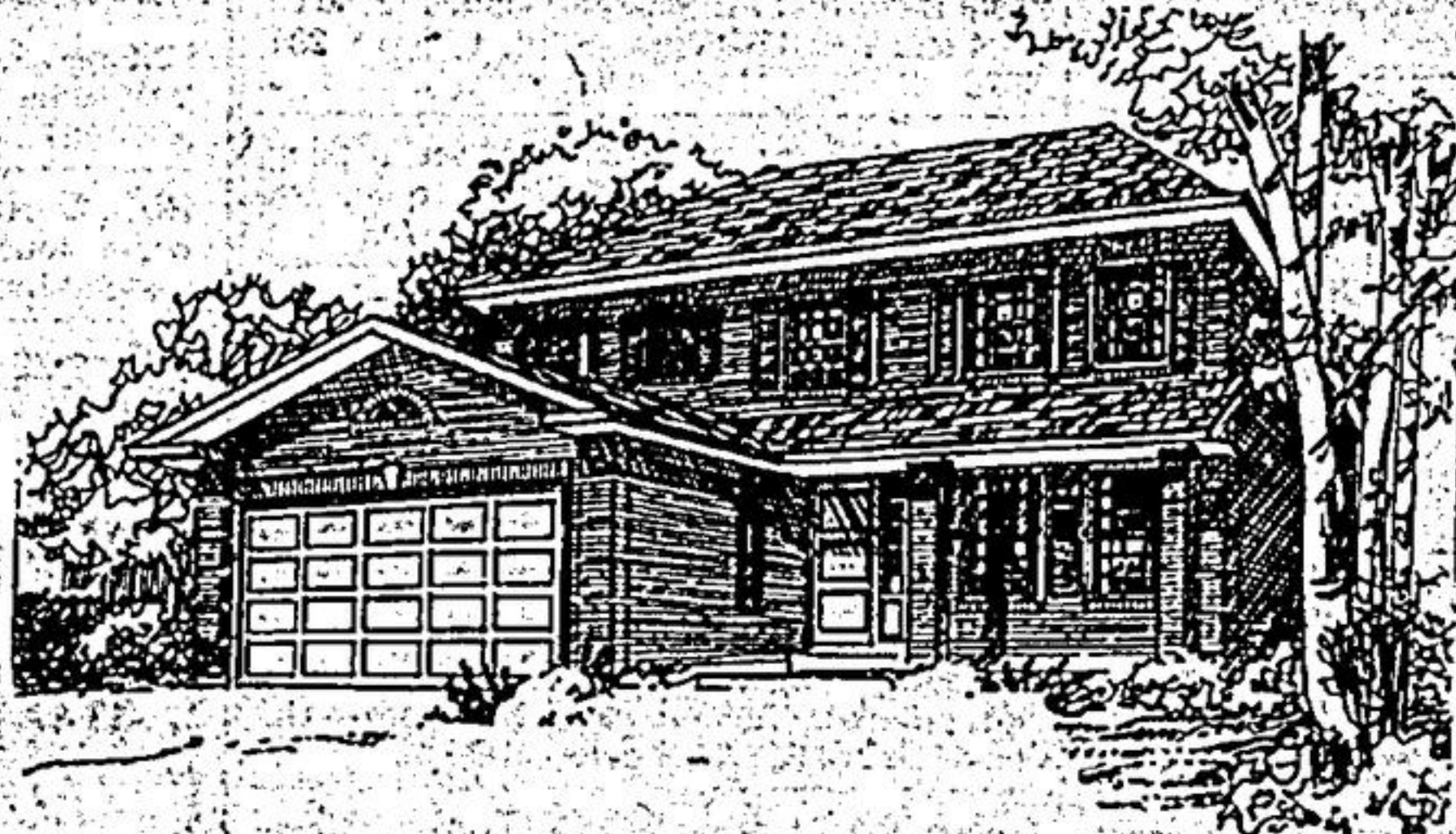
ROMARK III 2360 SQ. FT.

PRICES - $146,900 — $169,900 — UP TO 2830 SQ. FT.