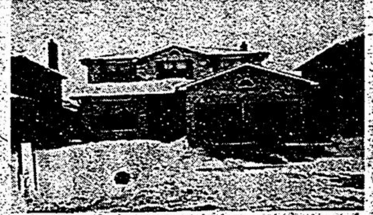
BUY IN WINTER - MOVE IN SUMMER