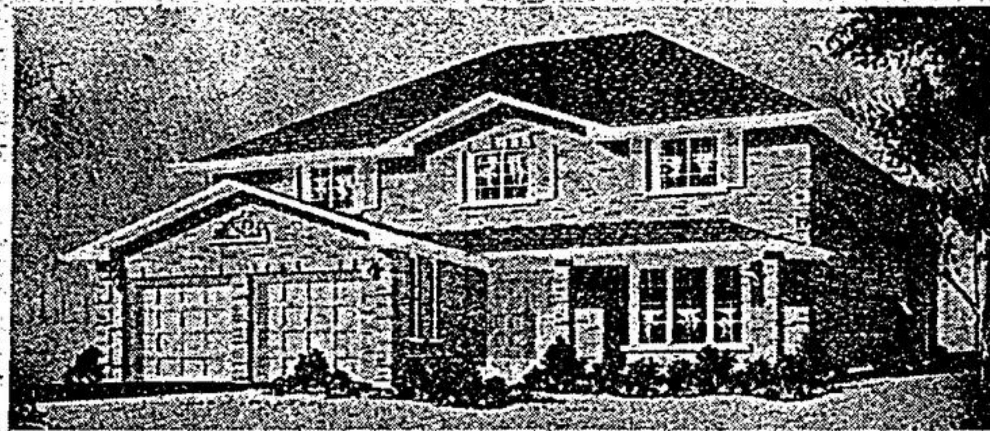
2 STOREYS ON 50' LOTS F5 Model

All situated on quiet crescent PRICES FROM $126,900 to $139,900 1850 sq. ft. to 2305 sq. ft.