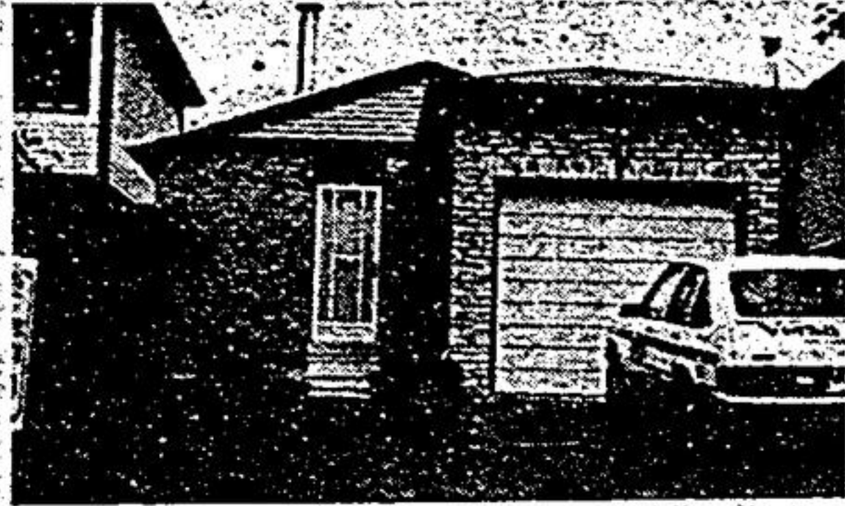
JUST LISTED - BUNGALOW - $109,850.

Super 3 bdrm. (2 + 1) upgraded dolls house, eat-in kitchen, fireplace, upgraded broadloom, ceramics, central vac, air cond. unit, B/I dishwasher. Pam Doyle now. #625