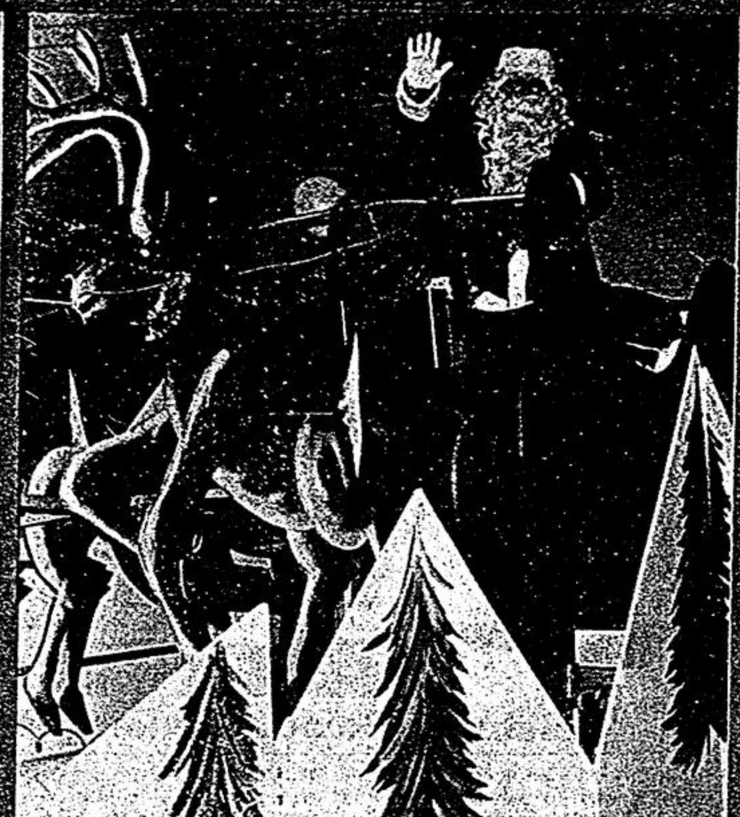
The parade wouldn't have been complete without this gentleman. The procession, more than a mile in length, included over 600 entries. It was sponsored by The Kinsmen Club.