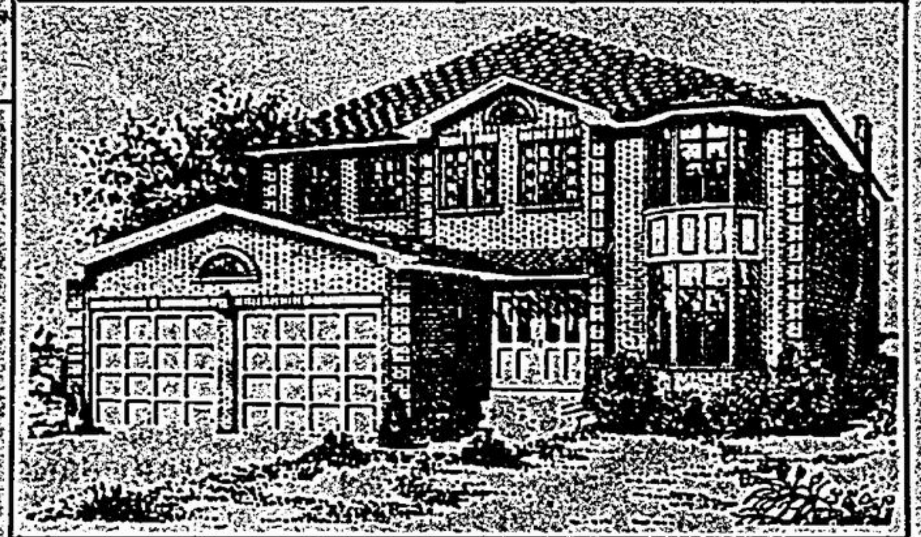
THE SCARLETT MAPLE (top right), the Silver Maple (left) and the Sugar Maple (right) are being offered in Markham by Maple Lane Lands and Developments Co. Ltd. Prices range from $151,800 to $166,200.