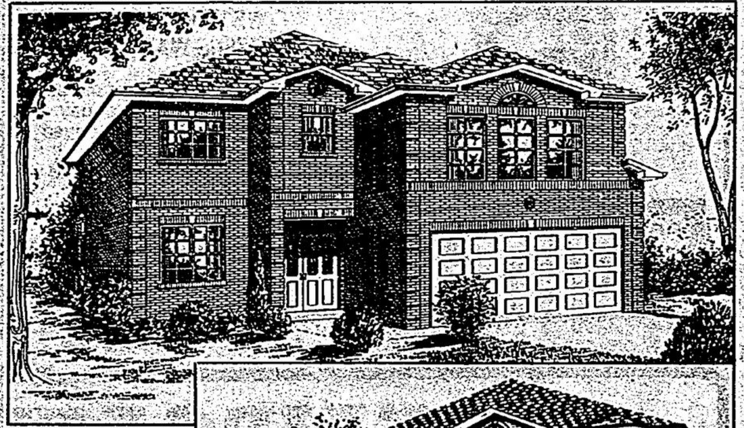
THE SCARLETT MAPLE (top right), the Silver Maple (left) and the Sugar Maple (right) are being offered in Markham by Maple Lane Lands and Developments Co. Ltd. Prices range from $151,800 to $166,200.