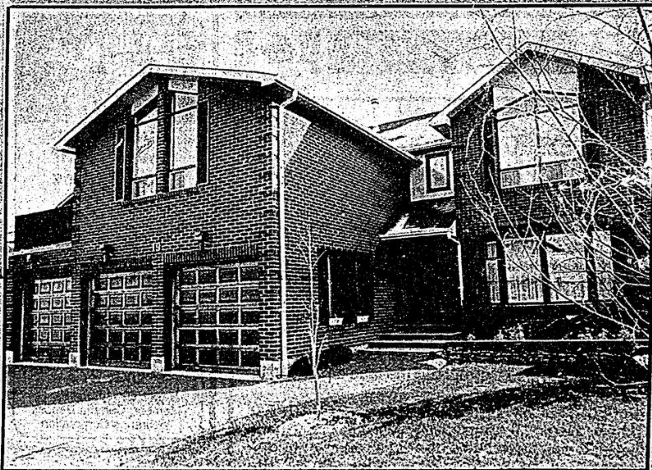
This Markham home lists at $239,900.