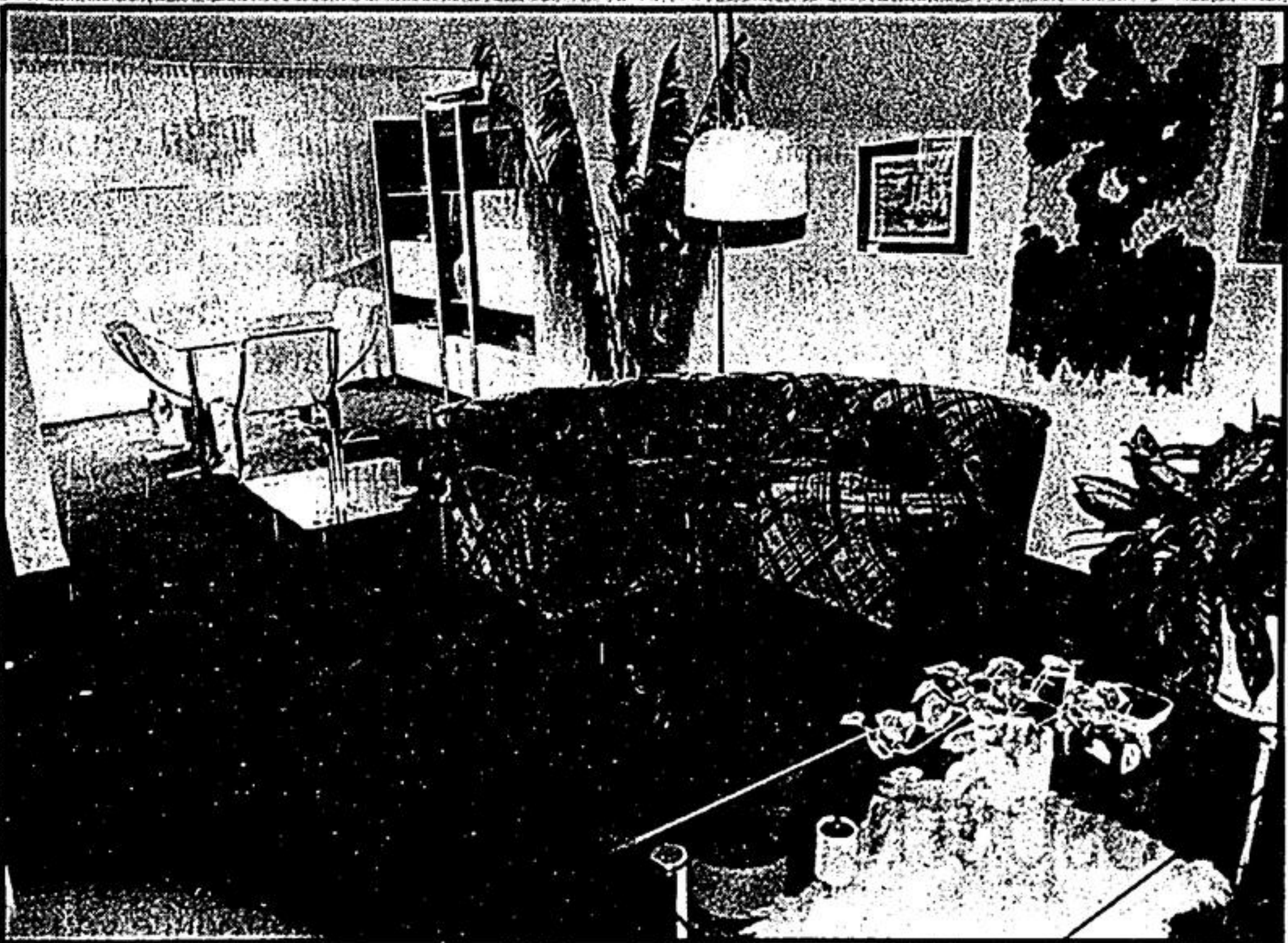
Living and dining room are combined