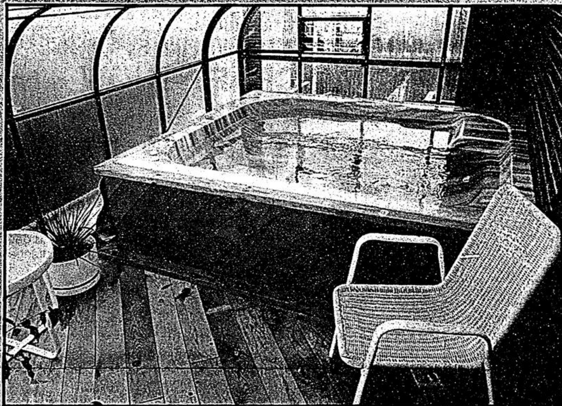
A hot tub and spa has been added