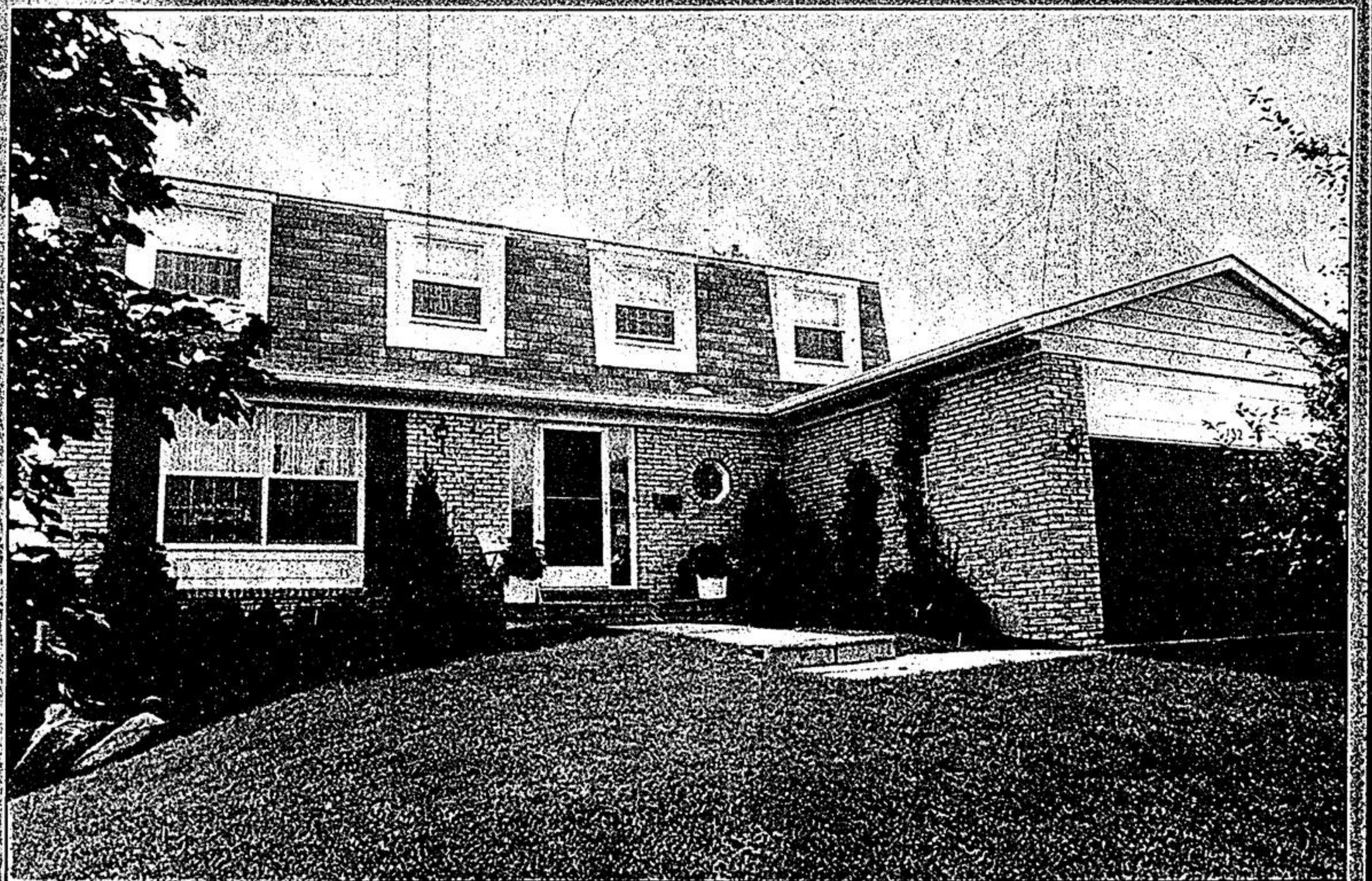
This Unionville residence lists at $195,000.