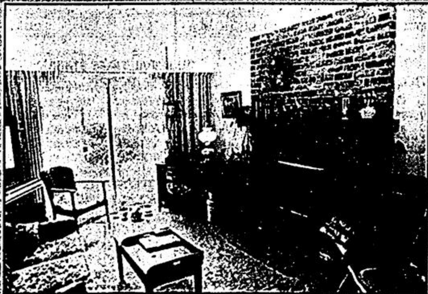
The main floor has a fireplace