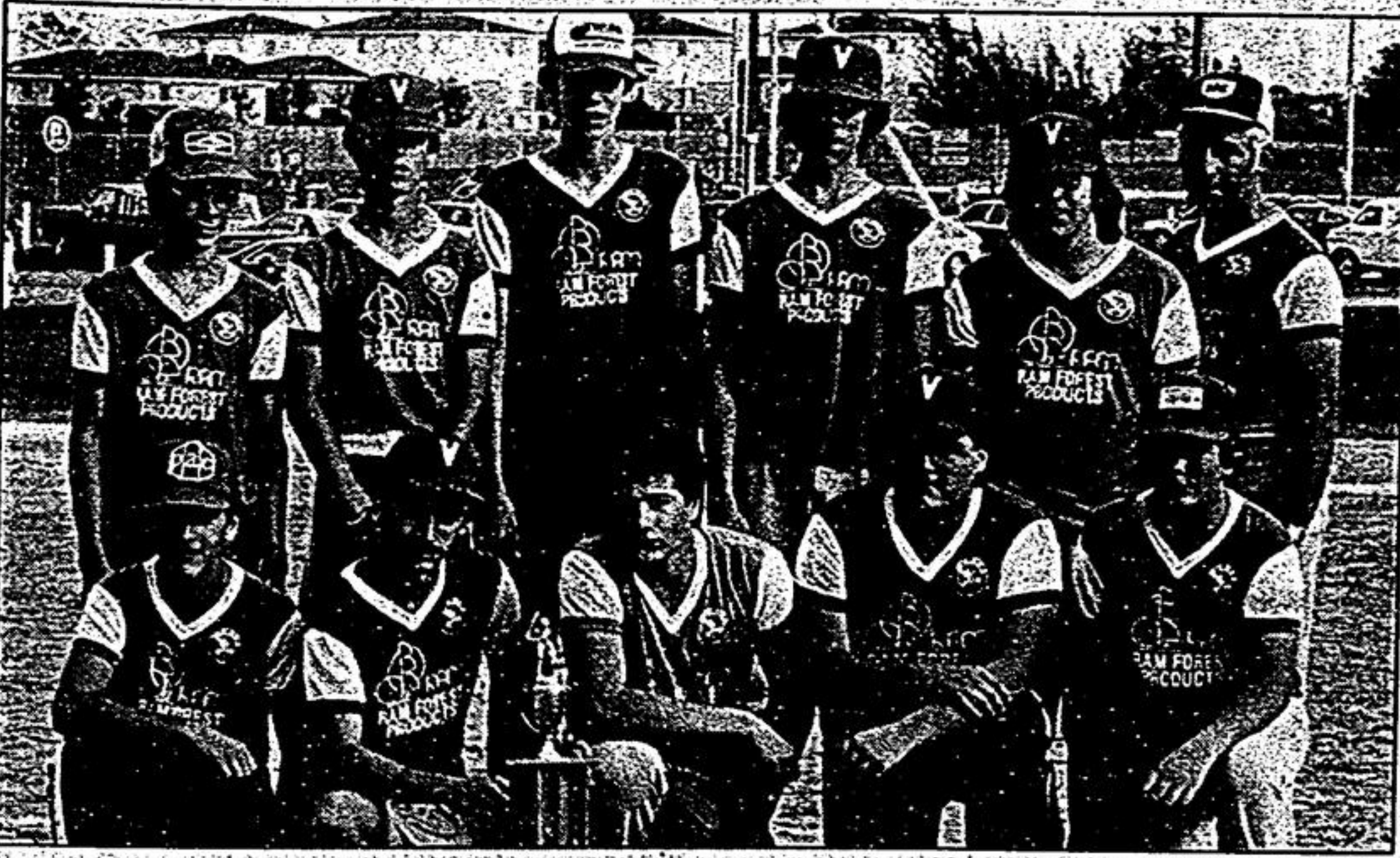
Ram Forest Products