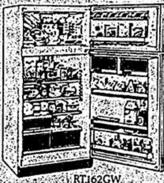
$22.84* a month

My, how time flies. Here we are, celebrating our 105th year. So, just to say thanks, everything, all the gas and electric appliances at your neighbourhood Appliance Centre have been specially priced. $22.84* a month or $839.95 (a $50 savings) is all it takes to own this 16.0 cu. ft. Hotpoint fridge in white. Almond's $10 extra. This 2-door frost free model includes veggie crispers, a meat drawer and handsome deluxe trim. $20.41* a month or $749.95 and save $50 off our regular price for this 30" Hardwick Gas Range in white. The almond costs $10 more. An easy clean model; it features chrome burner bowls, deluxe black glass door and custom trim.