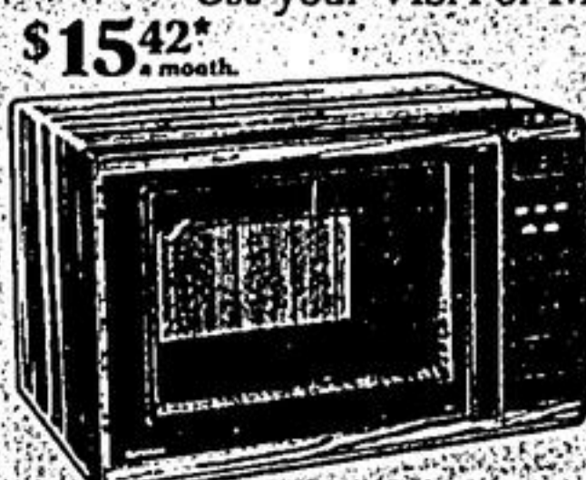
$15.42* a month

Or ask how you can charge your purchase on your gas bill* with no money down and make low monthly payments with up to five years to pay. If you buy something that requires the expertise of one of our professionals to install, put that on your gas bill too.