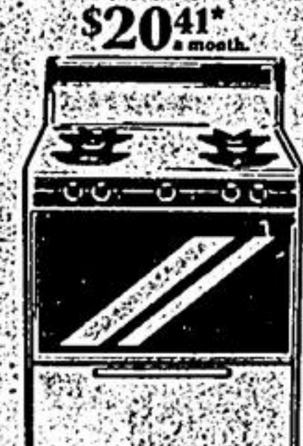
$20.41* a month

Automatic Washer is yours. Comes with 2 wash/spin speeds, 6 cycles including permanent press. Variable water level and temperature controls. Not to mention, a self-cleaning filter, fabric softener and bleach dispenser. $12.18* a month or