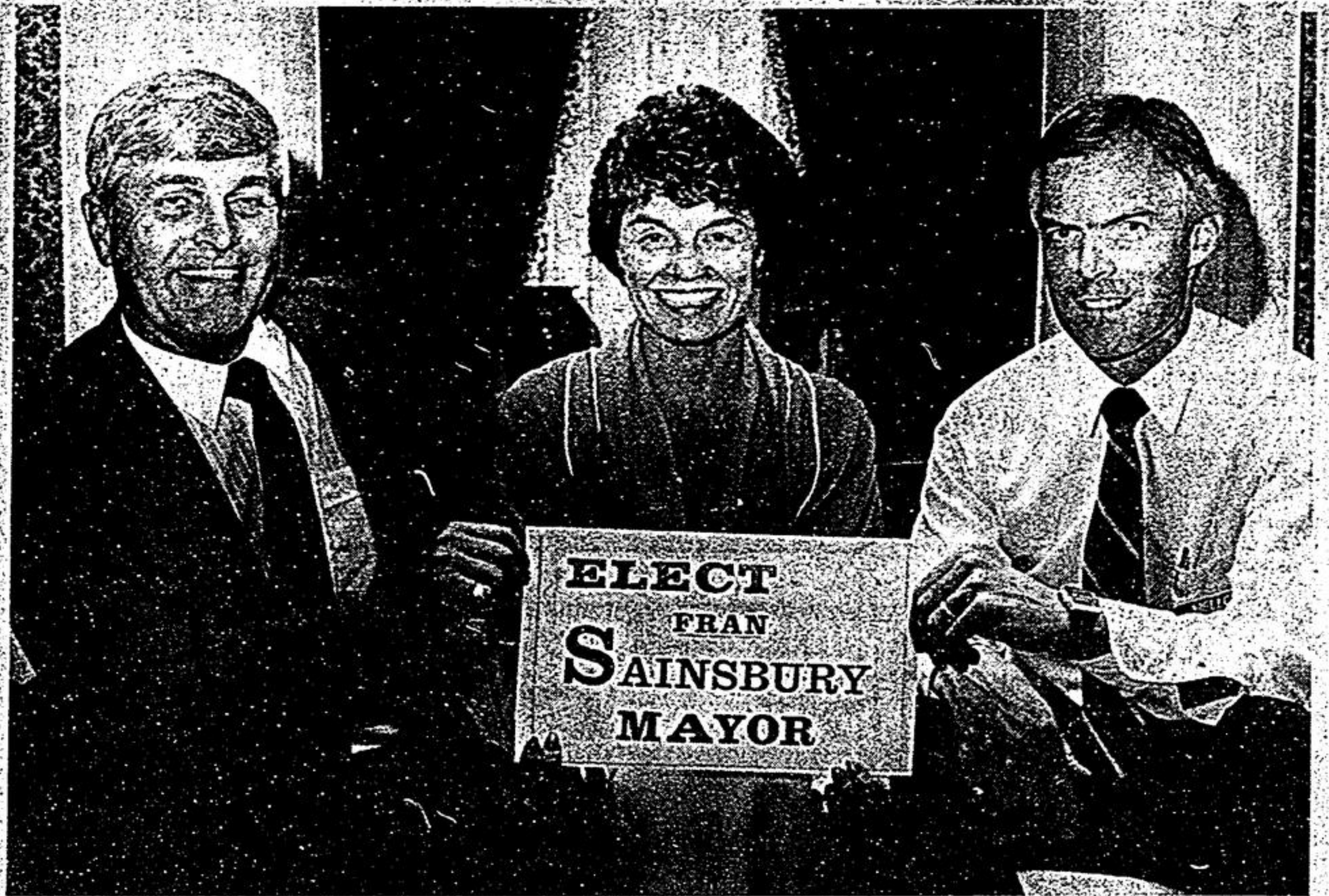
Mayorality candidate musters workers from across Town