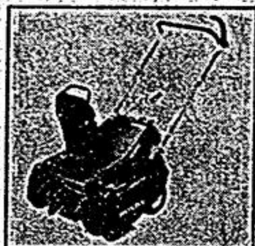
HS35C 3.5 hp, 500 mm (19.7 in.) clearing width