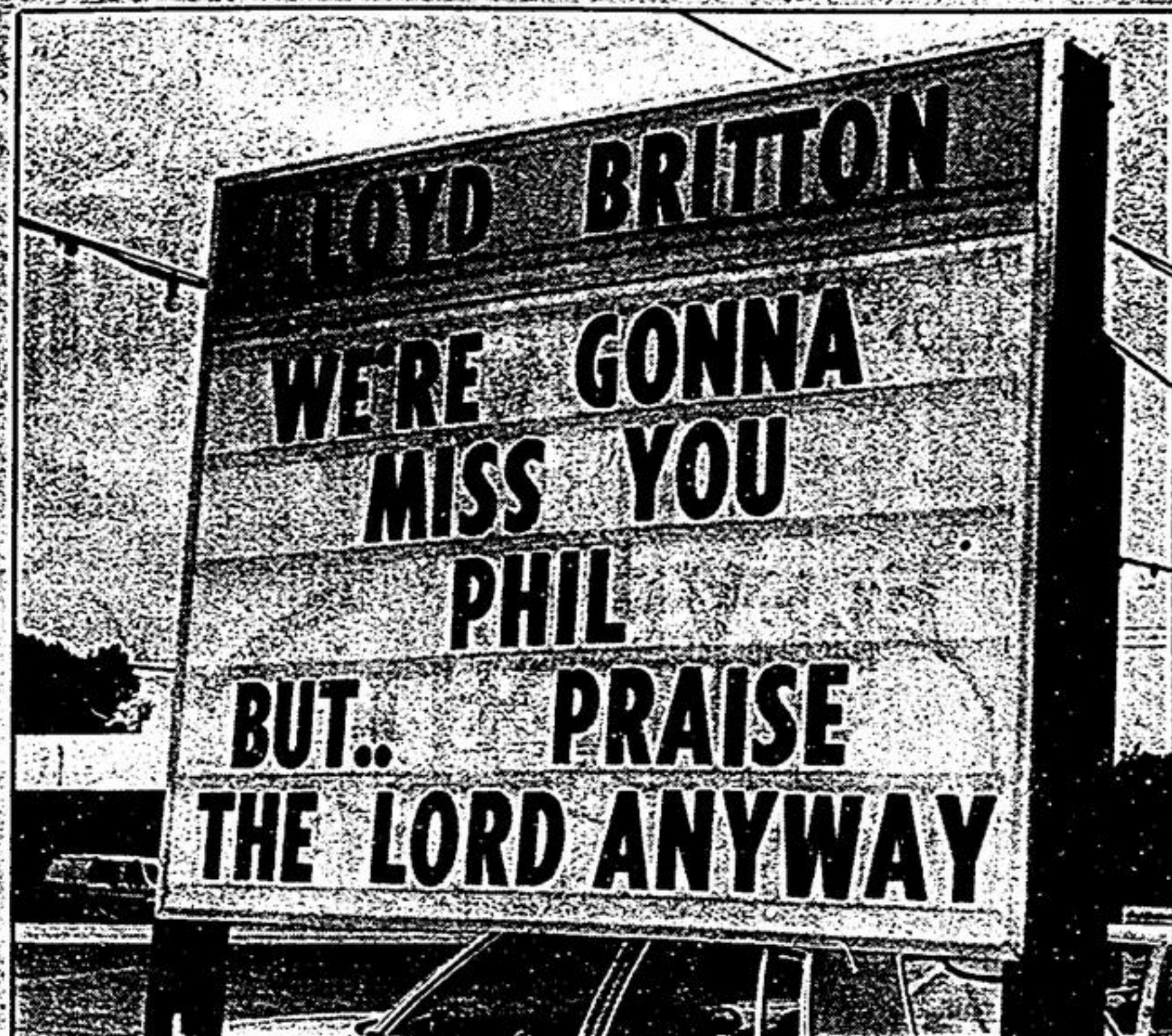
Sign depicts mixed feelings