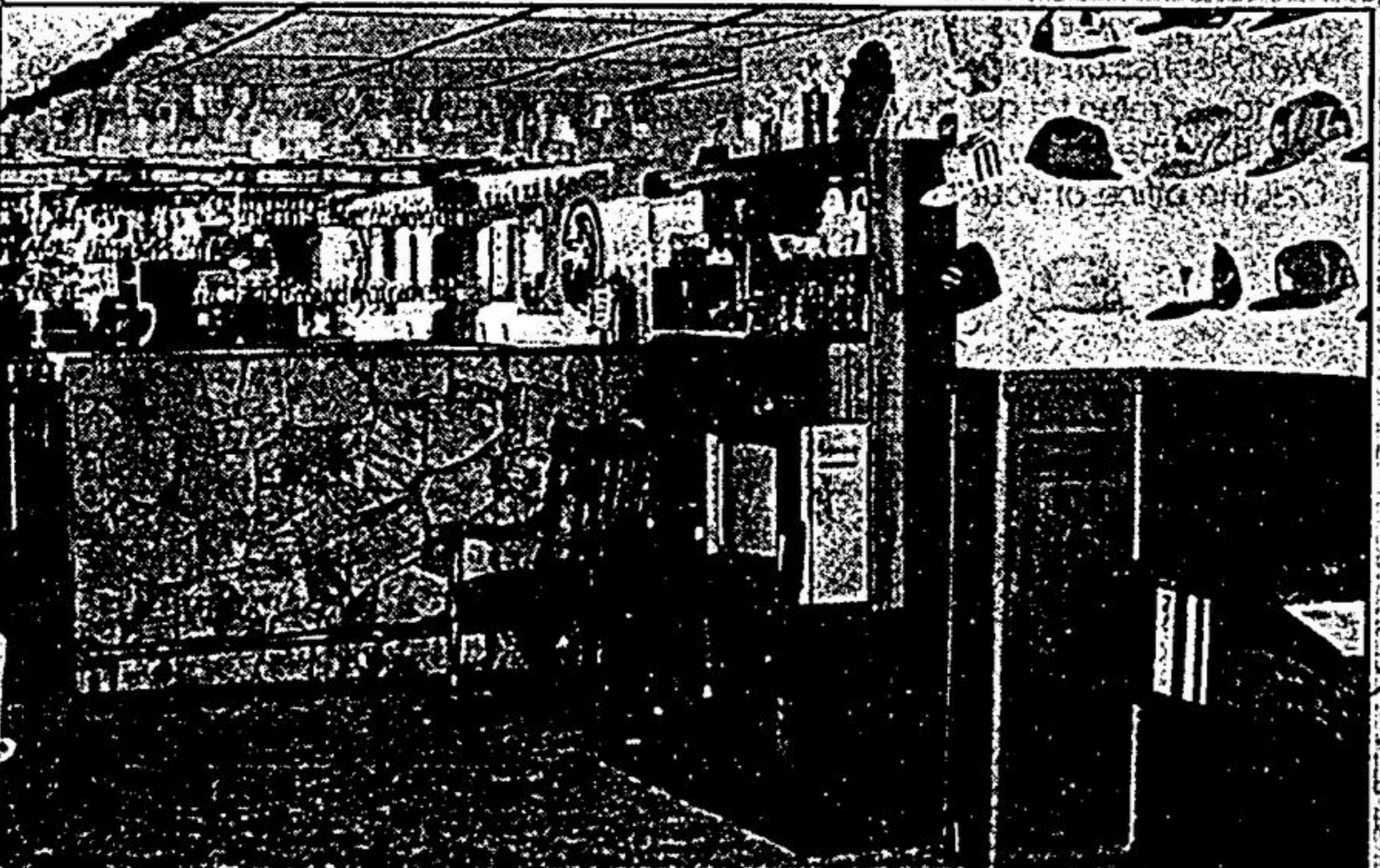
The recreation room has a large wet bar