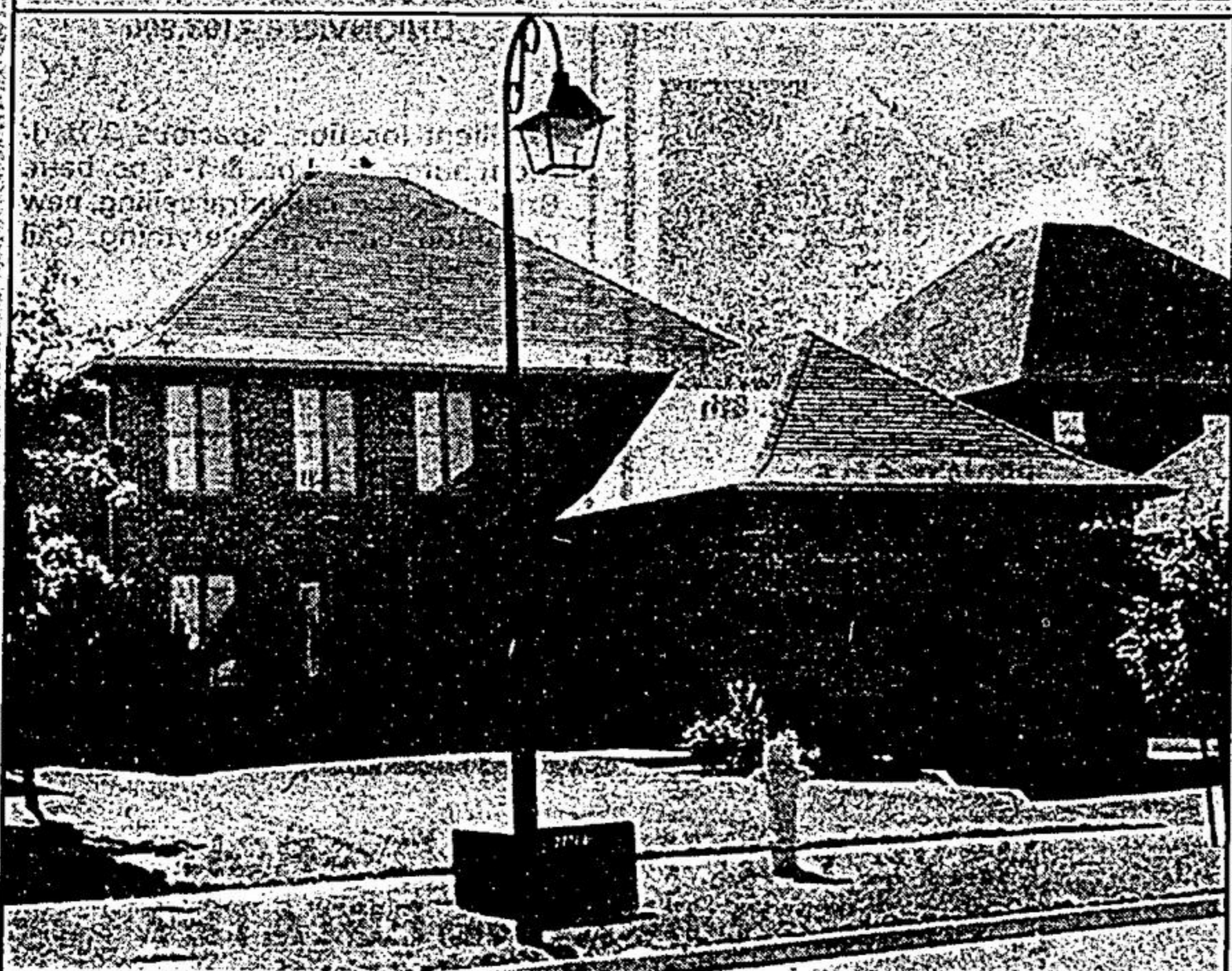
The Unionville home has an asking price of $259,000