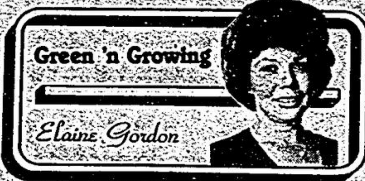
Green 'n Growing