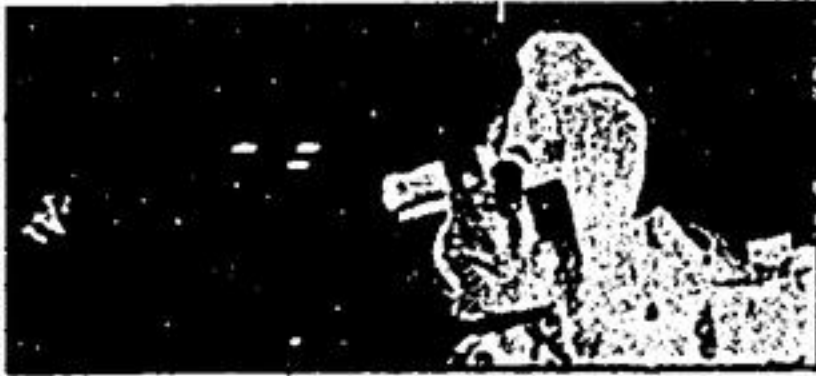
Many famous Tae Kwon-Do Teams invited from Europe, Washington, D.C., Montreal.