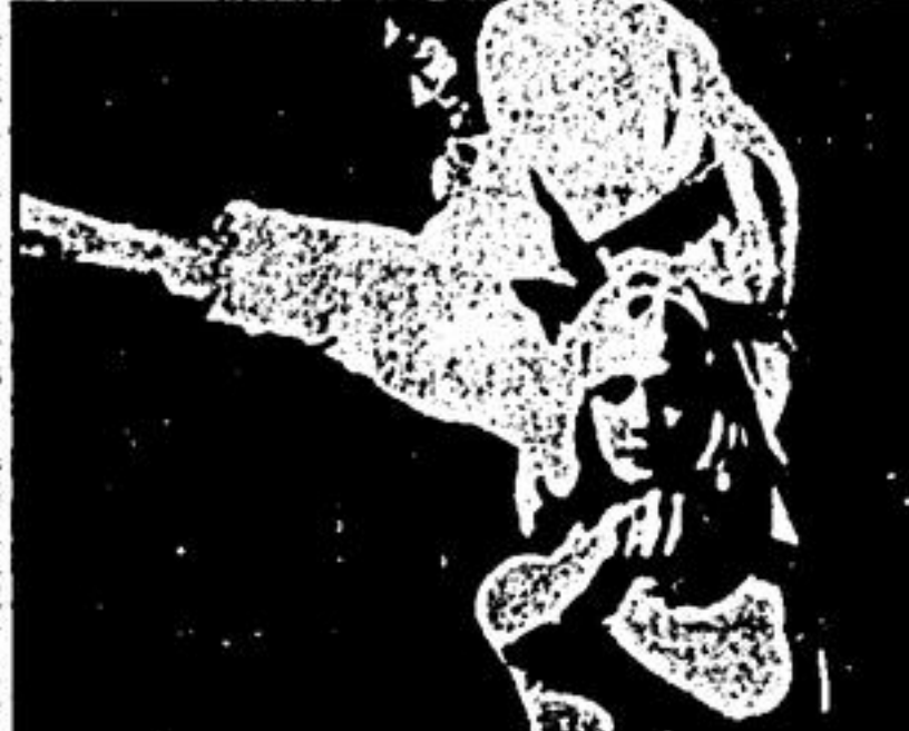
Complete training for men, women and children at Jong Park Institute.