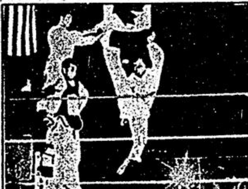
Park Jong Soo, 3 Times World Tour Demonstrator Displays a Flying High Kick.