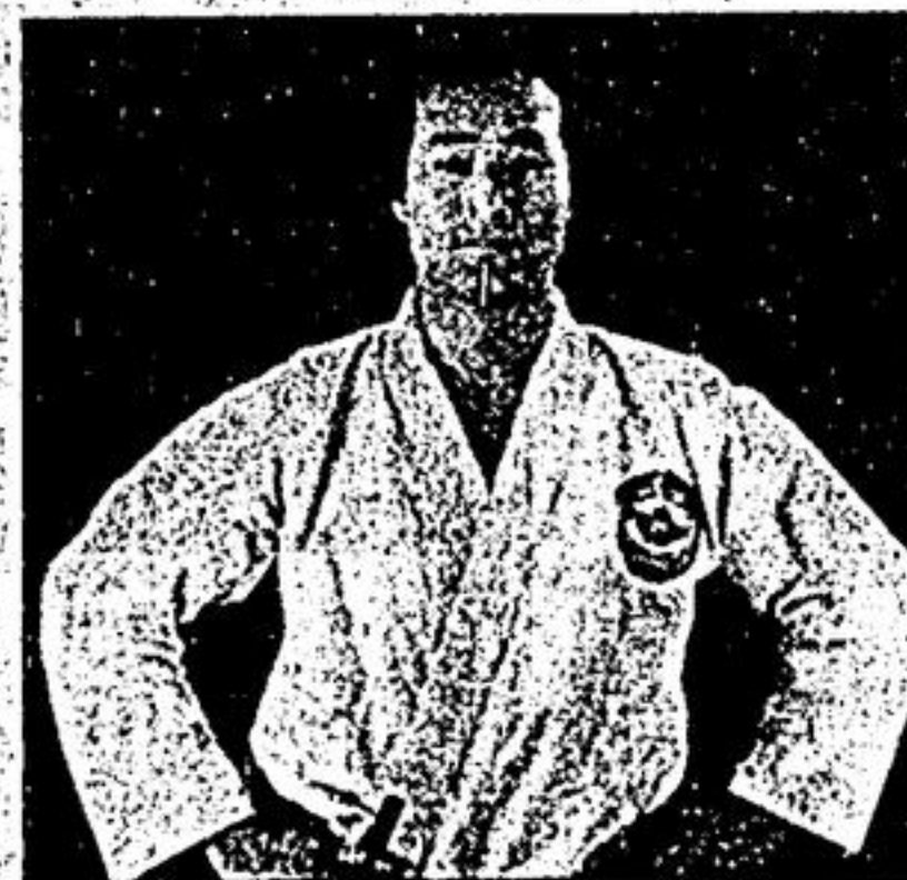
Park Jong Soo, 8th-Degree Black Belt, world renowned & master instructor, former Korean national champion.