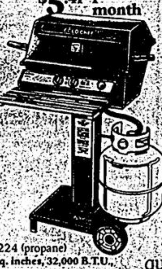
GC3224 (propane) 390 sq. inches, 32,000 B.T.U.; just $199.95 (tank extra). Save $40.00. Free cover.

laminized steel cooking grids, swing-away Redwood front shelf and warming rack, they're identical except for size and price.