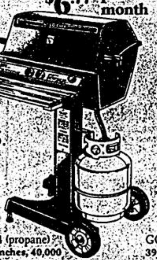
GC4024 (propane) 485 sq. inches, 40,000 B.T.U.; just $249.95 (tank extra). Save $40.00.

For great outdoor cooking, nothing beats