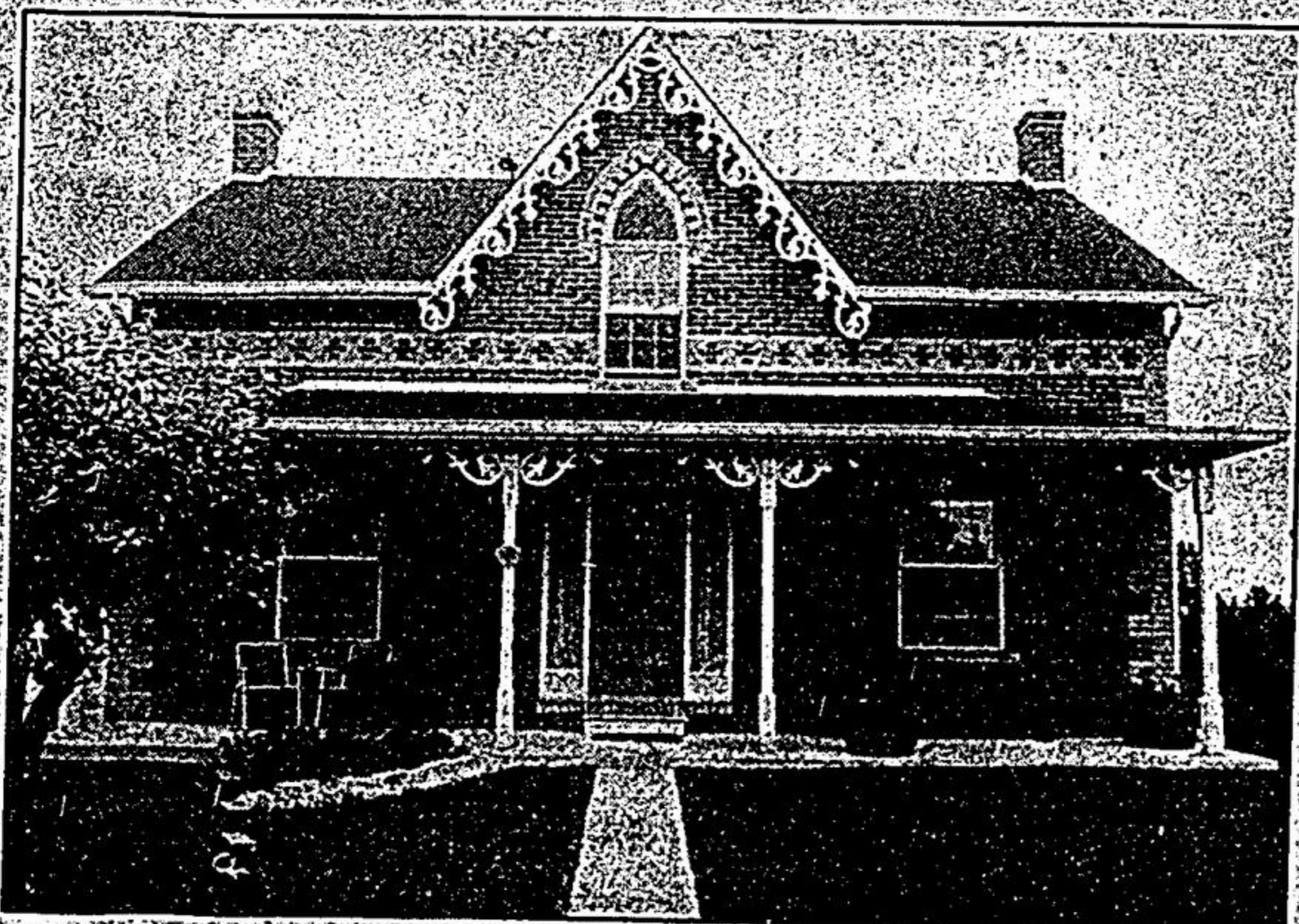
This home in Claremont has an asking price of $149,900