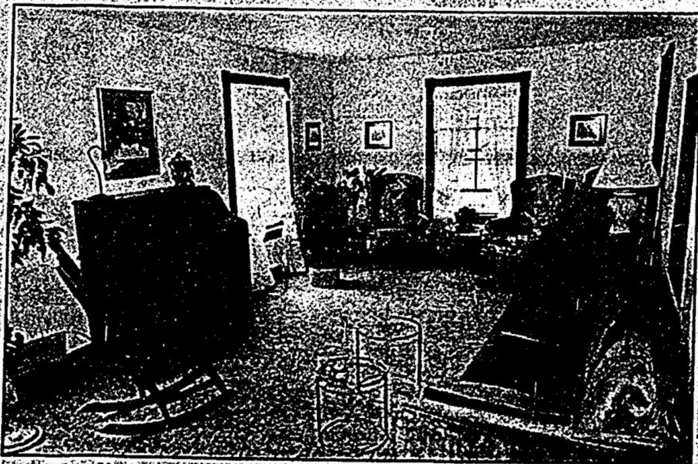
The living room is entered through french doors

The asking price for this home is $149,900 and it is listed with Royal LePage Realtors in Markham. For further information contact the listing agent Linda Carder by calling 471-4800.