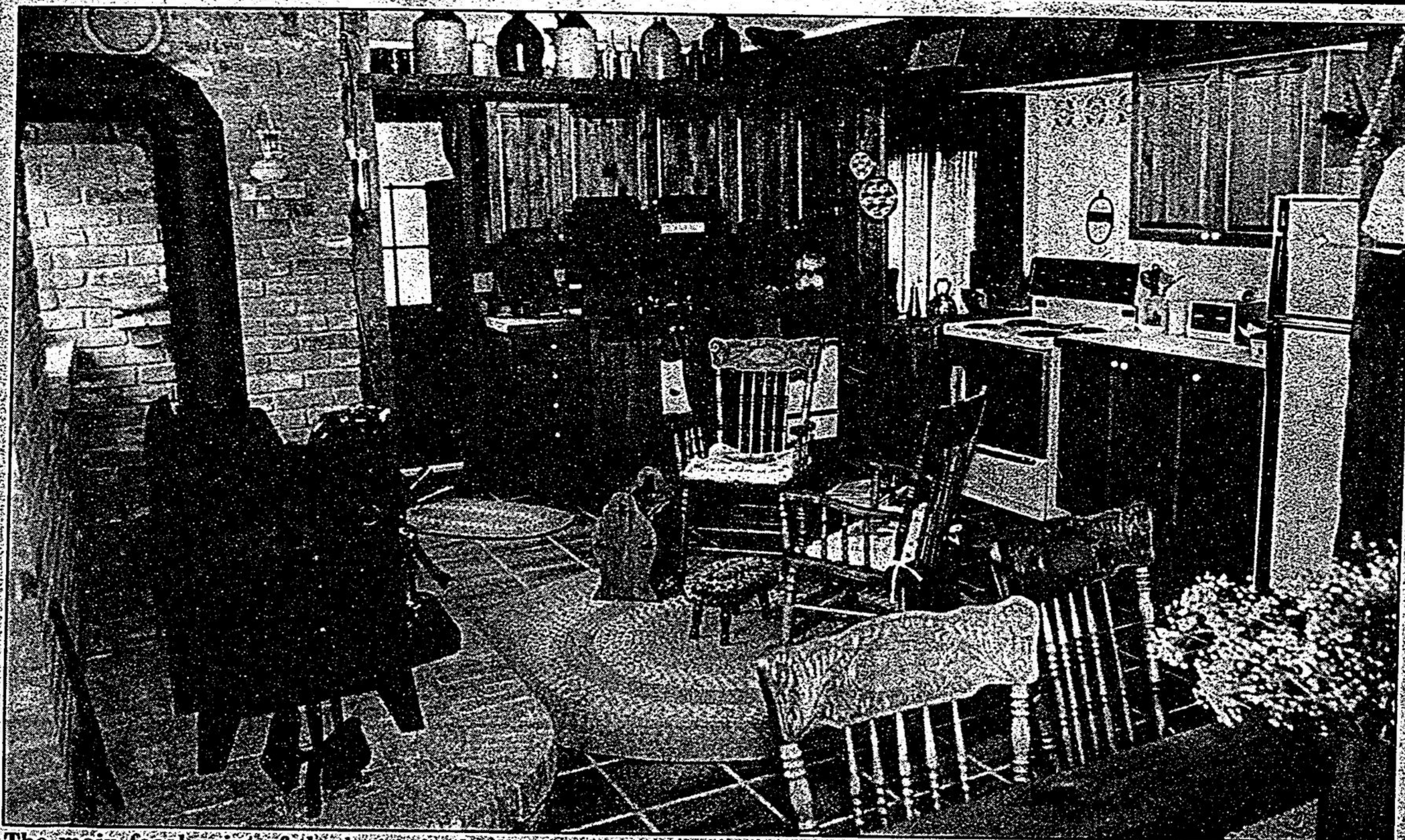
The main focal point of the house is the kitchen with its skylight, natural wood trim and plenty of cupboard space