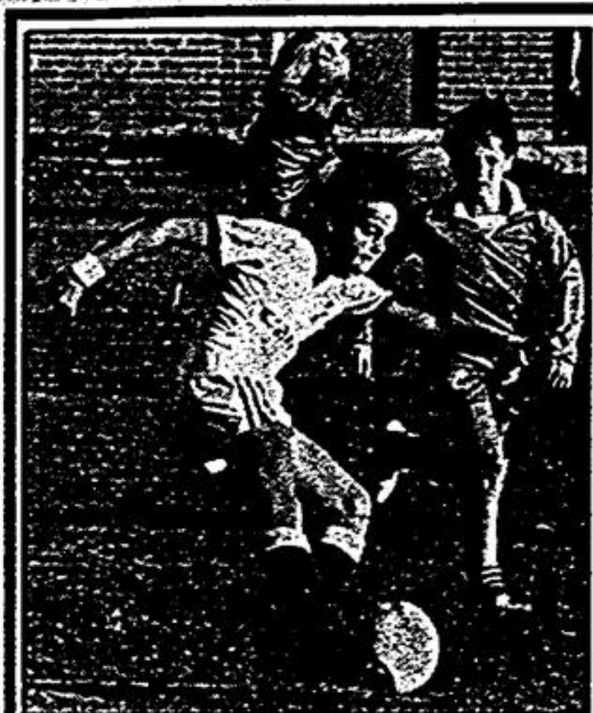
Do the twist...

Anyone wishing to apply for coach, manager or trainer on a rep team is requested to send a letter of application to P.O. Box 833, Stouffville on or before August 15.