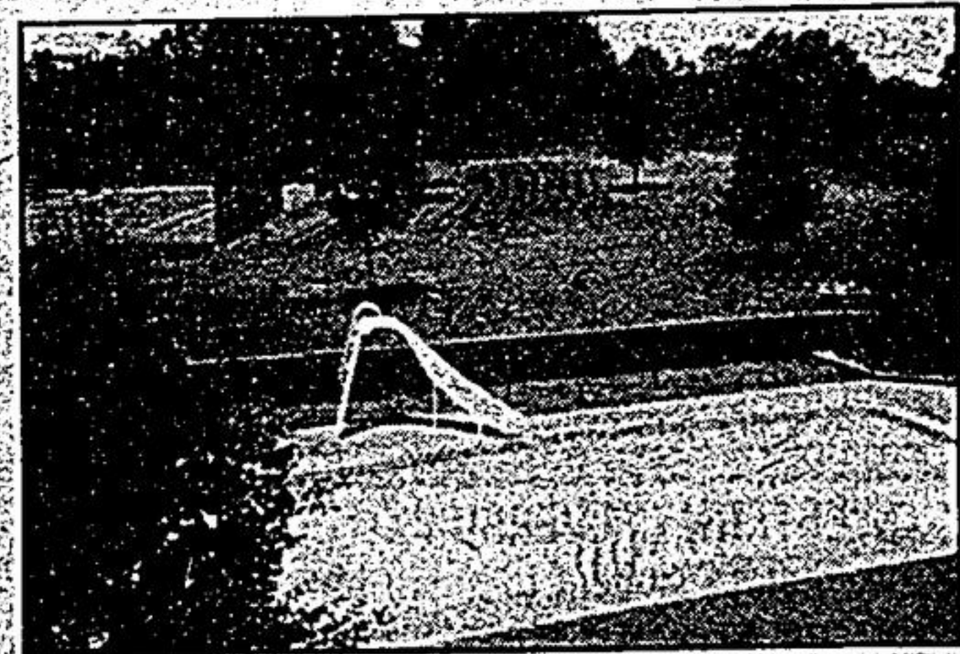
20'x40' Betz Gunite heated inground pool, extensive interlocking, lighted regulation tennis courts, BBQ & more!