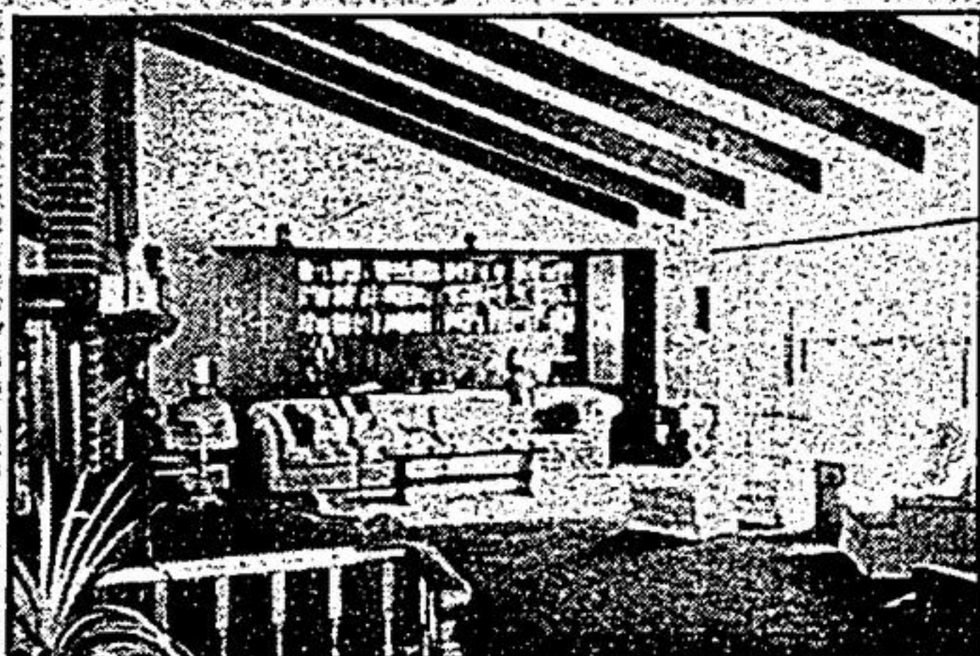
30'x19' Sunken living room, cathedral beamed ceilings, fireplace, par walkout to a view that will take your breath away.