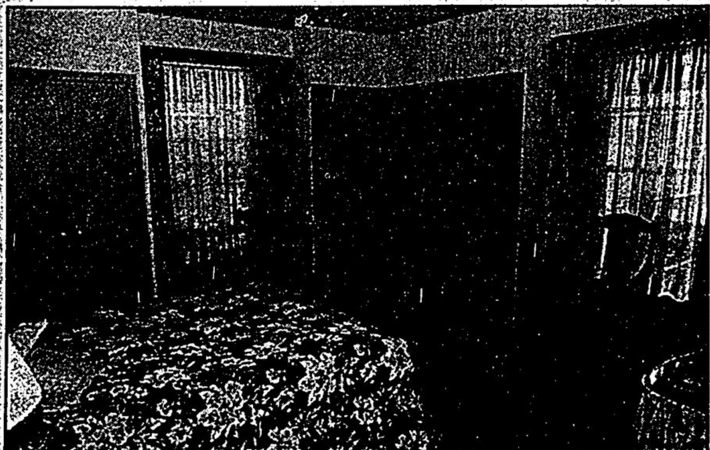
The master bedroom has built-in drawers.