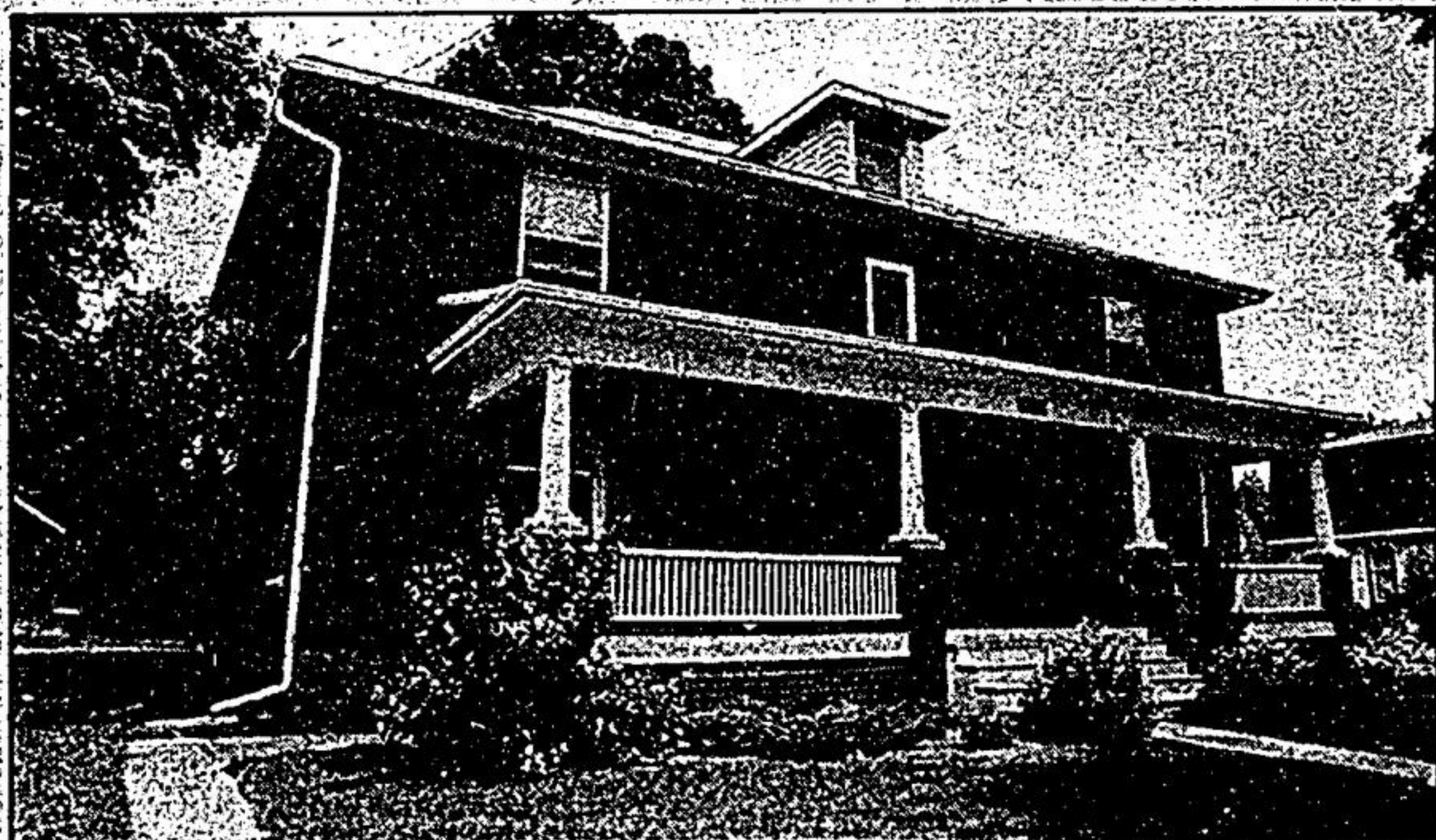
This home in Uxbridge has an asking price of $159,900.

The asking price for this home is $159,900 and it is listed with Family Trust Corporation Realtor in Uxbridge. For further information contact agent Gay Lacoursiere at 294-1372 or 640-1065.