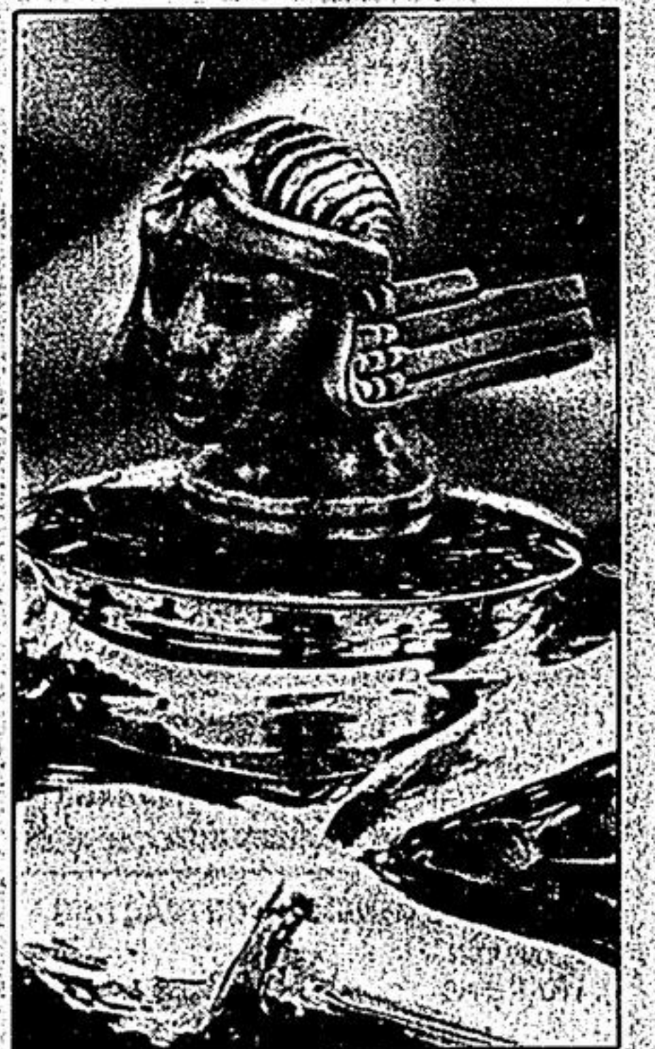
Hood ornaments were the thing back then — especially the one on this 1930 Stutz Bearcat.