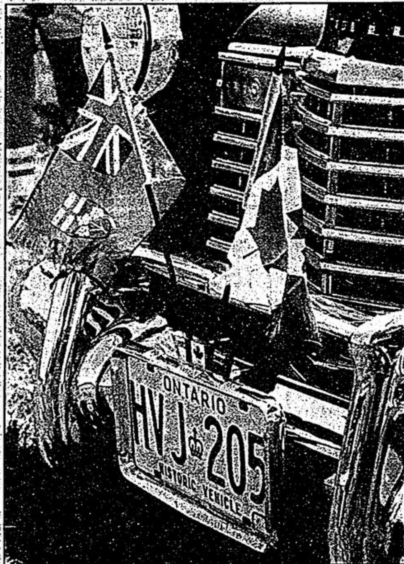
This Cadillac sports some extra front-end features — flags of Ontario and Canada at Sunday's antique car show at Bruce's Mill.