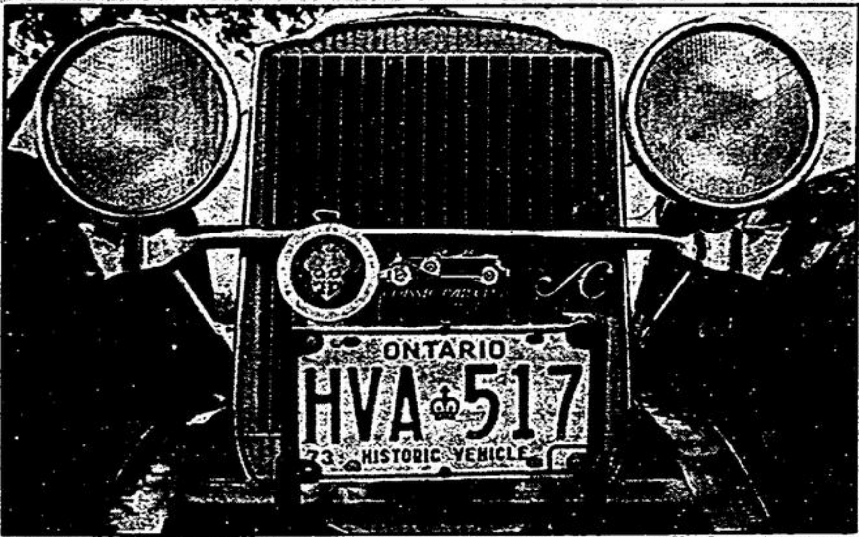
The grill of this Packard has a distinctive look that stands up well after 50 years.