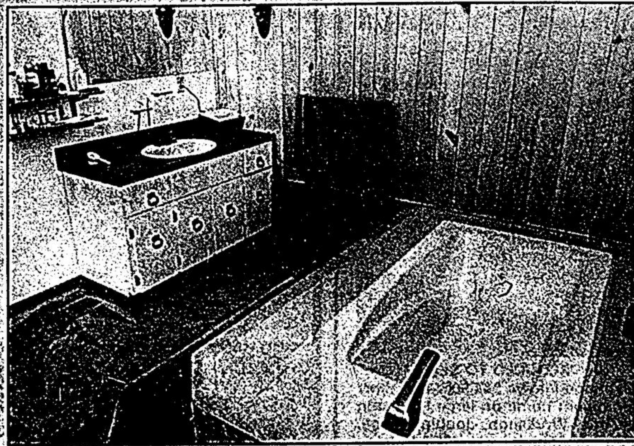
Carpeting is featured in the main-floor bathroom.