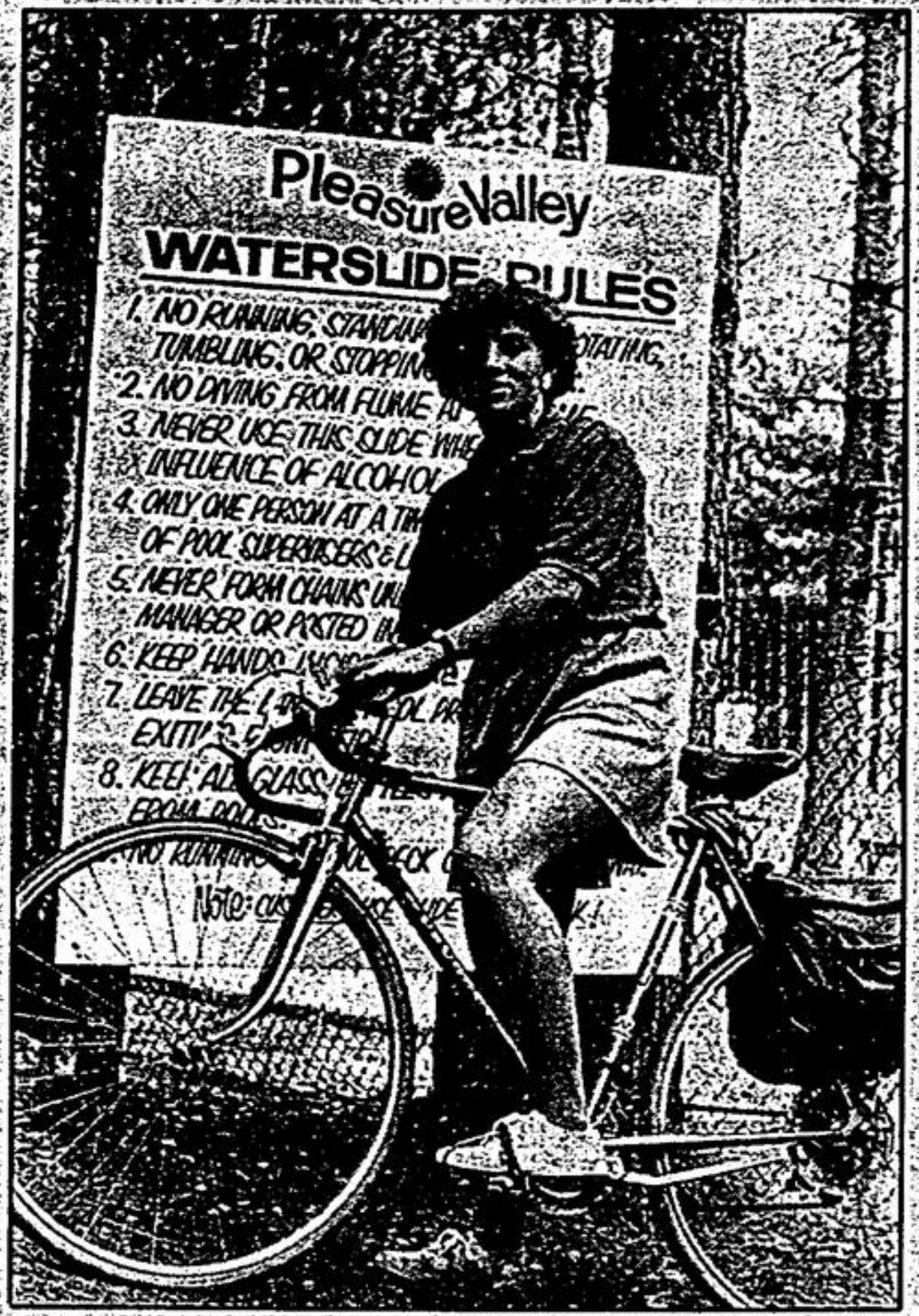
Quebec student enjoys stay

The 600-acre park, located on Brock Road north of Clarendon, offers a wide range of family-oriented recreational activities, including outdoor roller skating. —Chris Shanahan