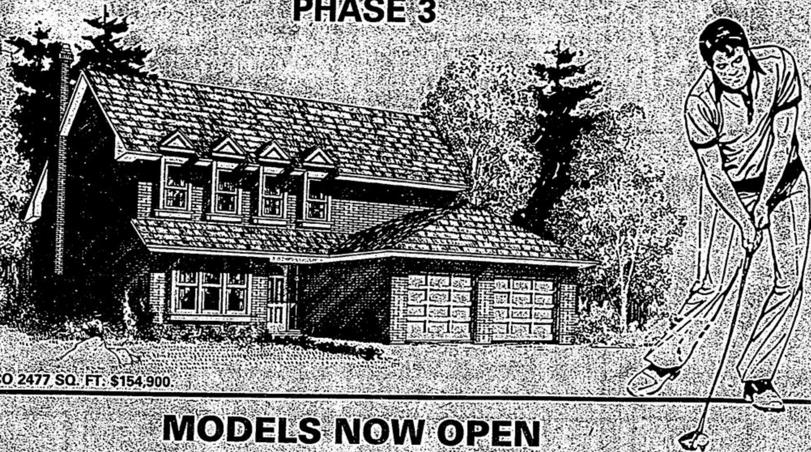
THE ELGRECO 2477 SQ. FT. $154,900.