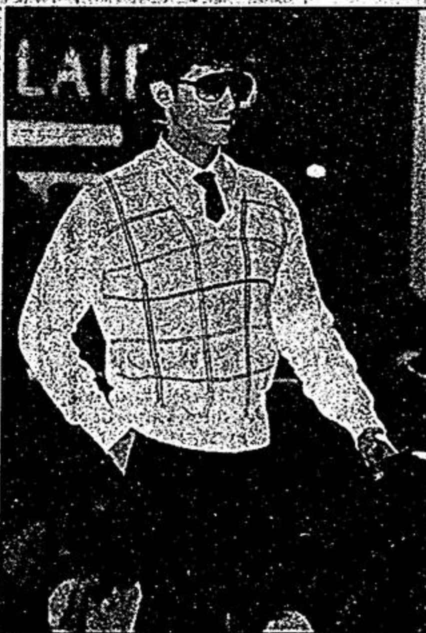
Sweaters are in this spring and so are the men's handbags. The ensemble is from Gentlemen's Court.