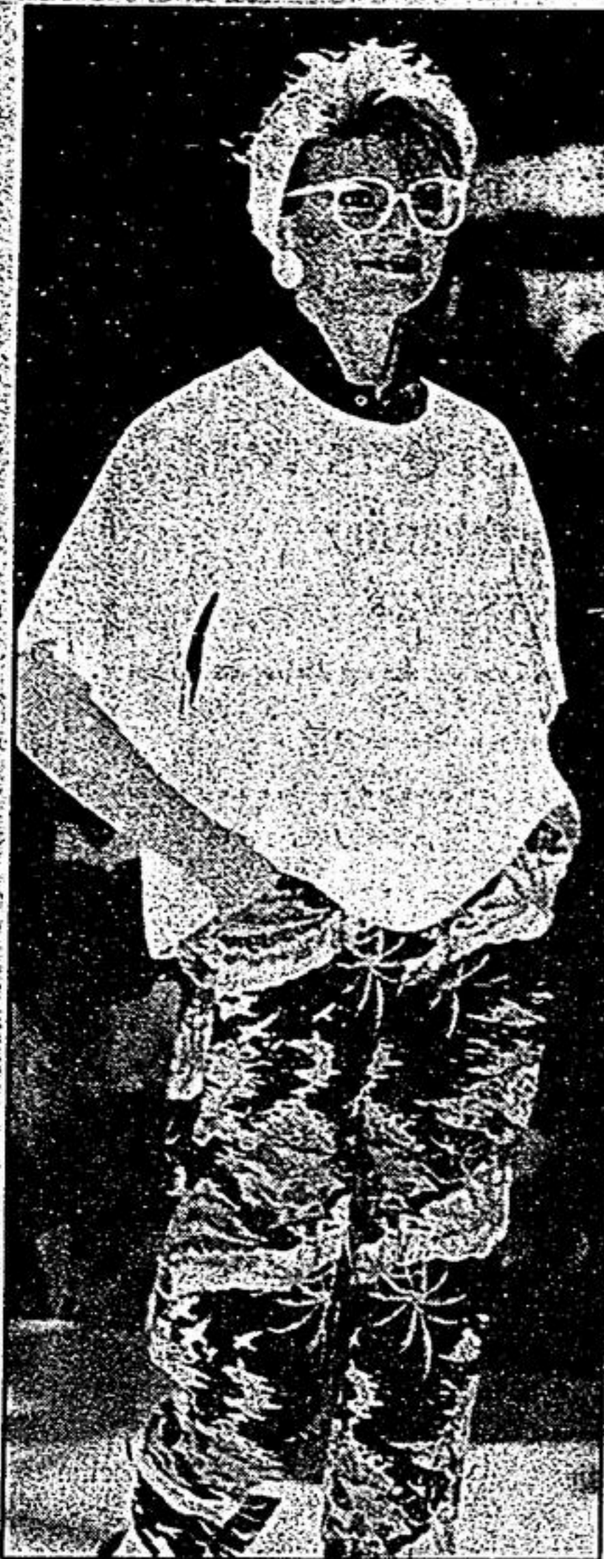
High fashion for the summertime. That's the theme in these exotically colored slacks fashioned by this model. The clothes are from Suzy Shier.