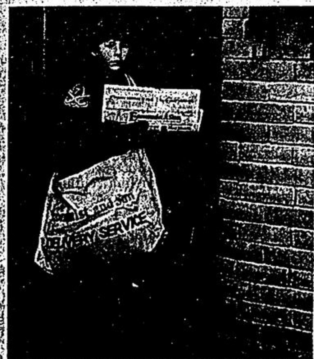
DAVID MURDOCK Raleigh Crescent Karma Road