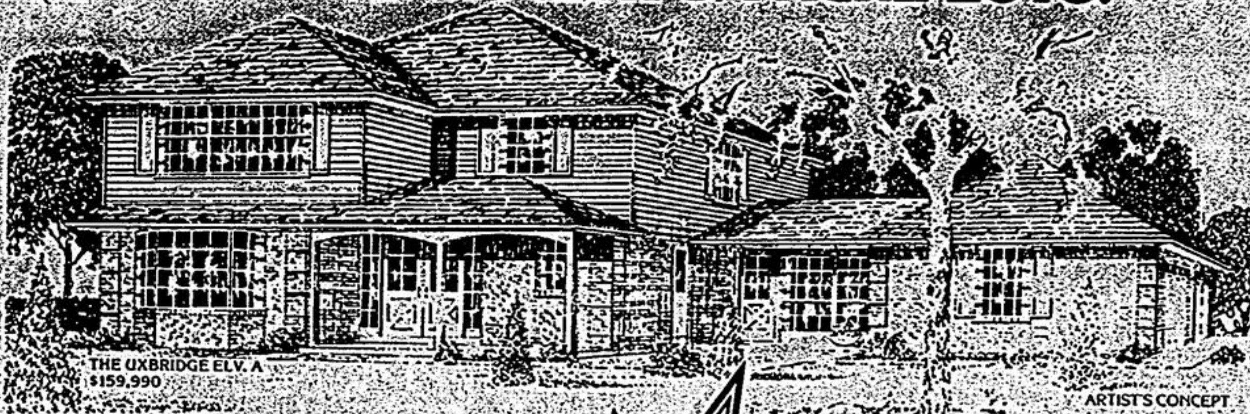
THE UXBRIDGE ELY, A $159,990