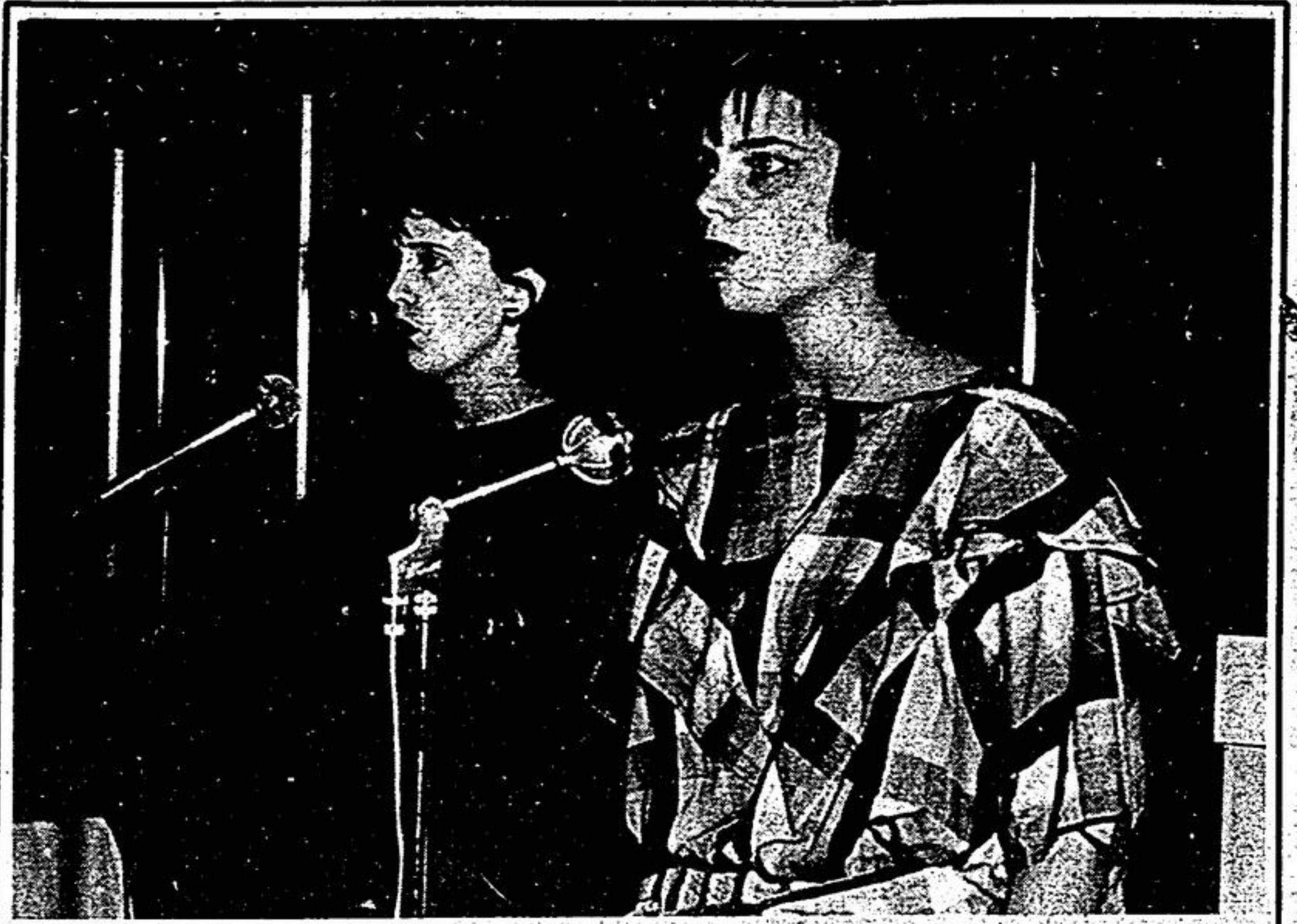
Sisters sing at Latcham Gallery party

Also included in the program is a 'Community Carol Sing-a-long' with the High School Concert Band.