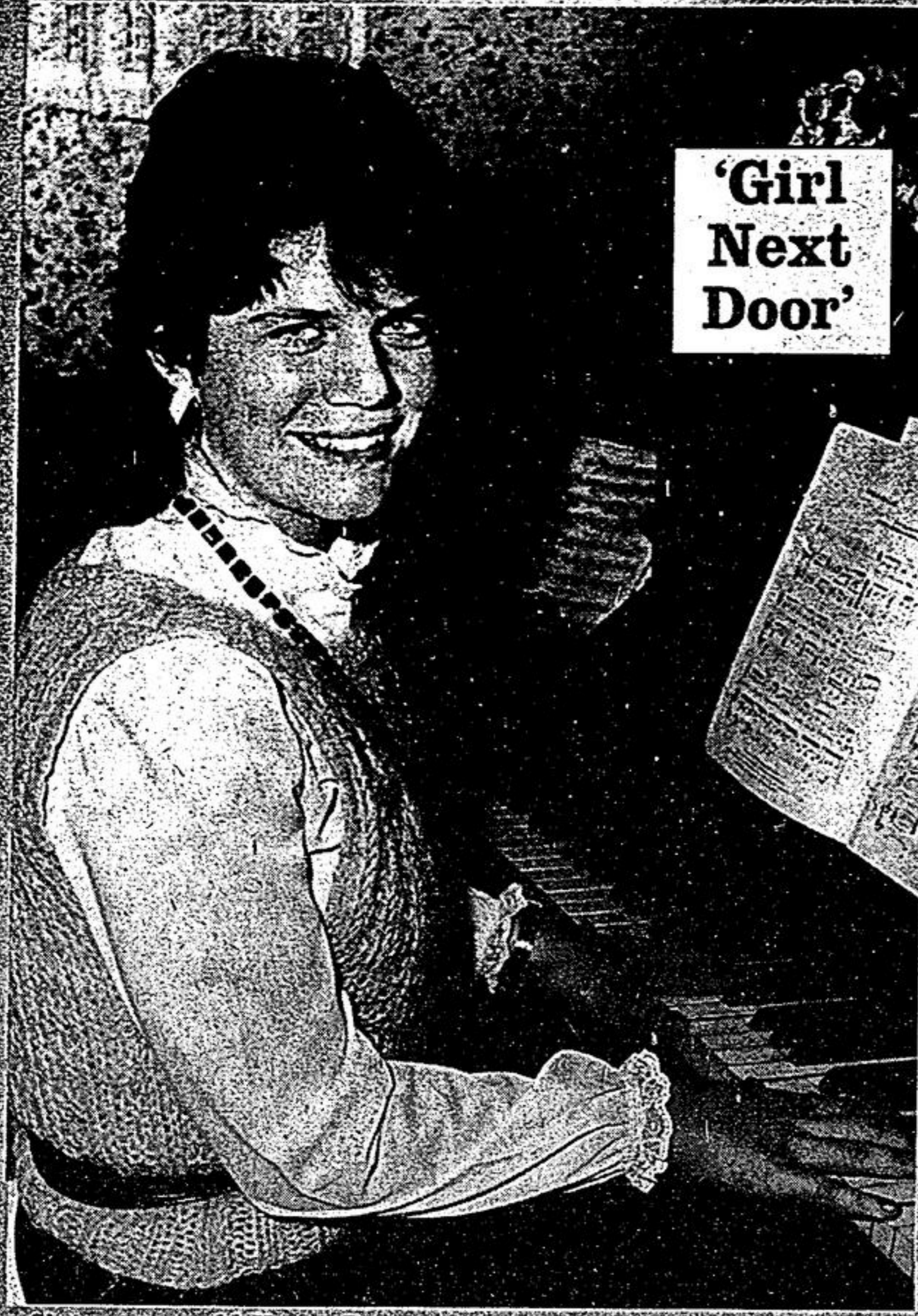
'Girl Next Door'