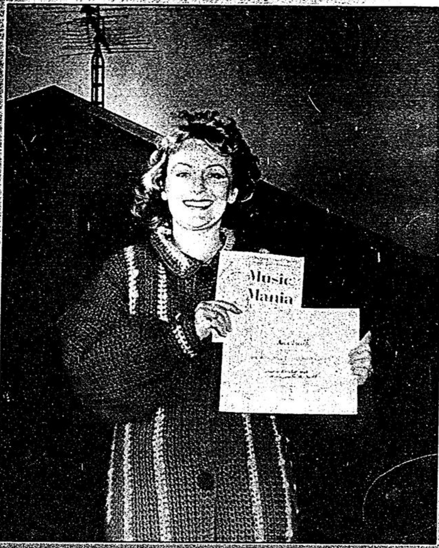
Extends welcome to former members

The first chorus practice is Jan. 10 — only eight weeks away. "We'll accommodate everyone," Ann can hardly wait.